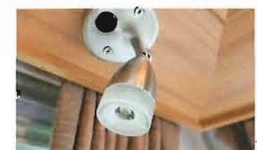
New LED spotlights draw less power than halogen spotlamps and don't heat up when in use