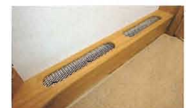
Alde system uses fluid-filled radiators to give even heat without the dryness of warm-air systems