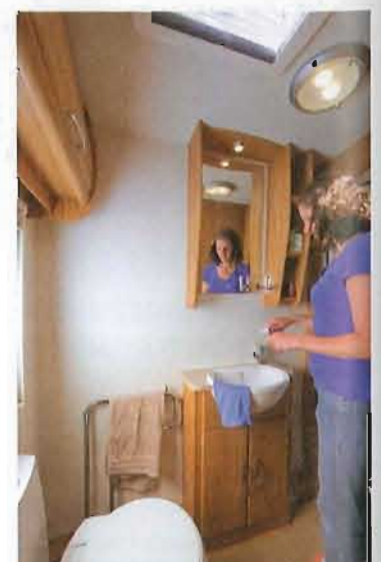
New heated towel rail is a nice touch and comes as standard