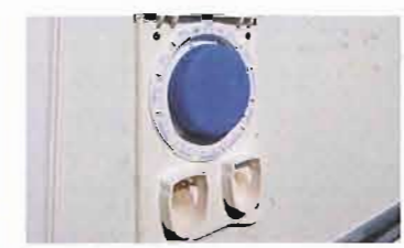
Super pitch connection means there is no need to use an aquaroll if your pitch has a water point