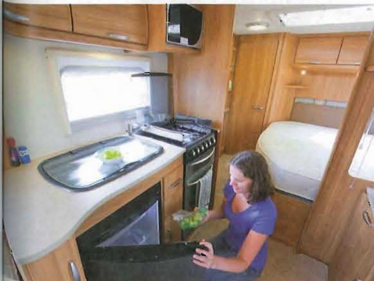
Kitchen area is well equipped with a Thetford 112-litre fridge, microwave, separate oven and grill and three-burner hob with electric hotplate