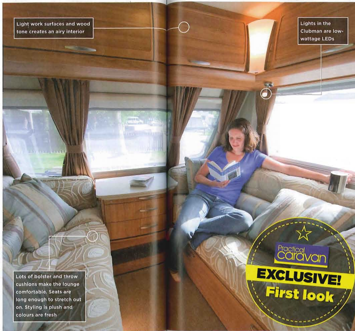
Light work surfaces and wood tone creates an airy interior

Very few niggles came to light during my time in the van, but there was one of note. The front steadies are very short. On a level pitch they sit comfortably at 45 degrees but blocks are needed on sloping pitches to keep them in contact with the ground.