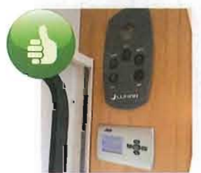
Lunar has put all switches together at the entrance