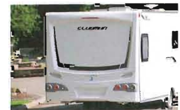
New graphics, stainless steel grab handles and redesigned rear panel help create a good-looking exterior