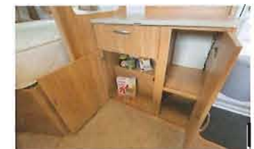
Alde heater frees storage space under sideboard, though some space is lost to the wheel arch