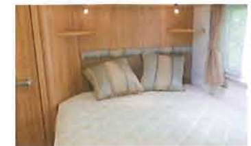
The fixed bed is large enough for six-footers and access to the washroom around the bed is good