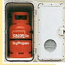
Side gas bottle locker