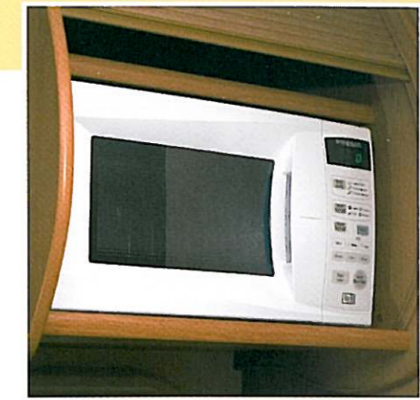
Microwave (model may vary)