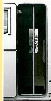
Door flyscreen (Dart only)