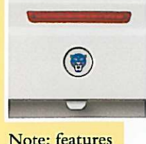
High intensity brake light