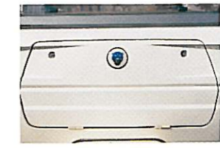
Front equipment locker