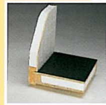
Rebated side to floor joint