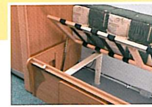
Lift & stay bed locker tops