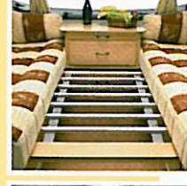
Easy pull bed slats