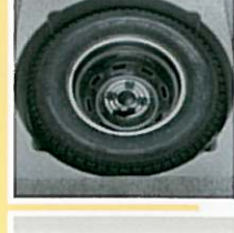
Spare wheel well