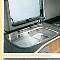
Sink, stainless steel, glass cover