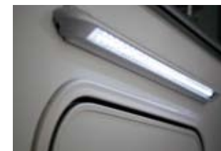
Awning light LED awning light provides energy efficient lighting