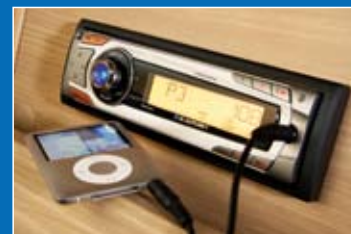
Radio/CD/MP3 player Radio/CD/MP3 player with iPod/ MP3 player connection

Spaceframe technology ensures seats and lockers are strong and precision-built.