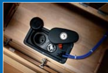
Water tank 40 litre underfloor insulated water tank (twin axles only)

Kitchens are well equipped with a 107-litre fridge with digital controls and built-in microwave oven, in addition to the multi fuel hob.