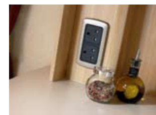
More mains sockets Models now feature five 230V sockets to meet modern power demands