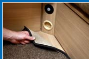
Quality carpet Luxury carpet with 45oz pile weight (a 70% increase) looks good longer

Fixed bed models have an 'Ultra comfort' luxury deep sprung mattress with an aluminium frame bed to maximise strength and storage space. All washrooms offer a fully lined shower, with end washroom layouts having the luxury of a walk in shower with a separate drying area. Hi-tech features include a radio/CD/MP3 player with iPod/MP3 player connection and an alarm system.