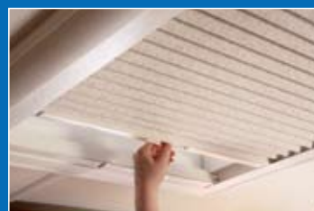
Pleated Heki blind Easy action pleated blind provides shade for day or night good longer