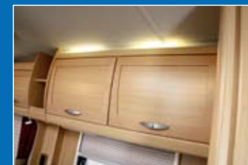
Over-locker ambient lighting Concealed soft white fluorescent tubes provides a warm, subtle interior light