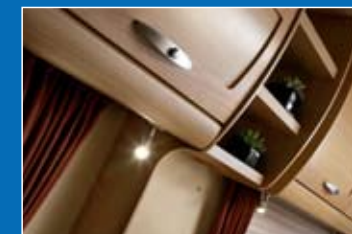
LED lighting Detail lighting by high output, soft white LEDs

New energy efficient lighting that features a combination of LED and ambient overlocker lighting saves 50% of full lighting power consumption. This prolongs the life of your battery and makes it realistic to power the system from a solar panel, giving greater independence.