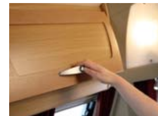
Positive door catches Positive catches on all overhead locker doors provide secure storage, even whilst on the move