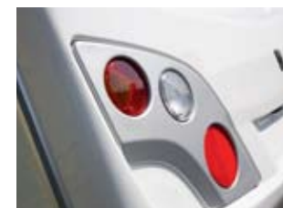
Rear lights Stylish rear light clusters