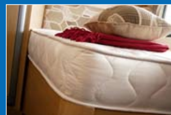
'Ultra comfort' mattress A high quality interior sprung mattress in fixed bed models for a really comfortable nights sleep

Fully fitted luxury washrooms with separate sealed shower cubicles are featured in all models, with end washroom layouts having a spacious walk-in shower with separate drying area. Security features have been improved with the first tracking system for the leisure industry that is Thatcham approved, 'HAL Locate', with Europe-wide cover. Additional features include AL-KO Secure wheel lock (two on twin axles, one on single axle) an intruder alarm and high security exterior door lock.