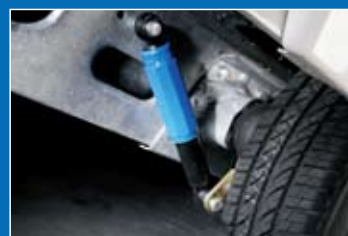
Shock absorbers Shock absorbers give more stable, smooth towing

With all models being 7'6" wide and offering class leading headroom there is more useful space inside. Contemporary soft furnishing and classic 'Ferrara' light oak woodgrain create a calm interior which is made more comfortable with thick luxury carpet. Spaceframe technology ensures seats and lockers are strong and precision-built.