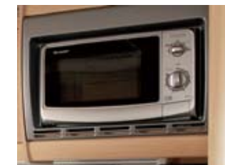
Microwave 700W microwave oven built into a ventilated compartment