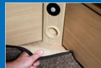
Quality carpet Luxury carpet with 45oz pile weight (a 70% increase) looks good longer