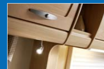
LED lighting Detail lighting by high output, soft white LEDs

This luxurious single and twin-axle range offers everything you need for life in the great outdoors. The high standards set by the Spectrum's distinctive exterior with its refined badging and graphics are easily matched within. New energy efficient lighting, that uses mainly LEDs combined with ambient overlocker lighting, saves 50% of full lighting power consumption. This leads to a longer battery life, giving greater independence and makes solar power a real option.