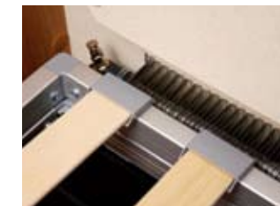
Alde heating Twin axle models have Alde radiator central heating with 24/7 timer