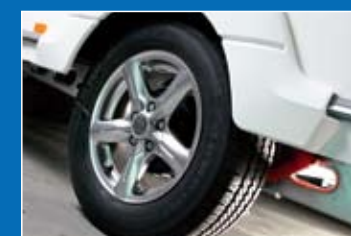
Alloy wheels Stylish alloy wheels with receiver for AL-KO Secure portable wheel lock