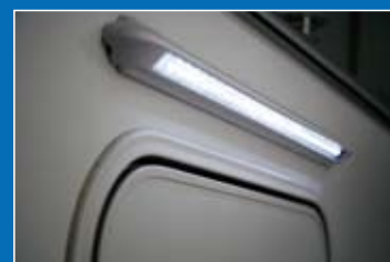
Awning light LED awning light provides energy efficient lighting