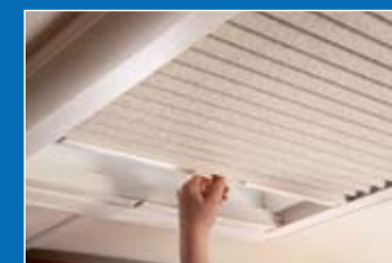
Pleated Heki blind Easy action pleated blind provides shade for day or night

Fully fitted luxury washrooms with separate sealed shower cubicles are featured in all models, with end washroom layouts having a spacious walk-in shower with separate drying area. Security features have been improved with the first tracking system for the leisure industry that is Thatcham approved, 'HAL Locate', with Europe-wide cover. Additional features include AL-KO Secure wheel lock (two on twin axles, one on single axle) an intruder alarm and high security exterior door lock.