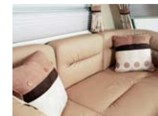
Leather furnishing An optional beige leather furnishing scheme is available on fixed bed models