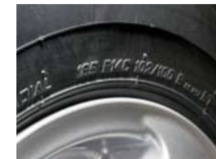
Tyre rating Higher tyre rating allows a greater safety margin for sustained higher speeds