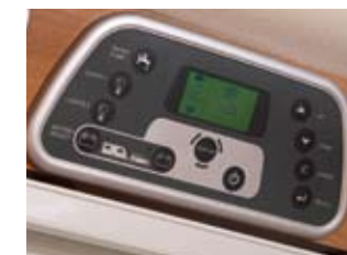
Auto tank fill The water tank is automatically topped up from the chosen external source. The system condition is shown on the control panel