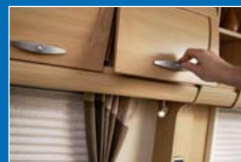
Positive door catches Positive catches on all overhead locker doors provide secure storage, even whilst on the move

Fixed bed models come with an 'Ultra comfort' luxury deep sprung mattress, an aluminium bed frame to maximise strength and storage space and the option of a beige leather furnishing scheme. Kitchens are spacious and well equipped with all the standard features you would expect including a microwave oven, dual fuel hob and large fridge with salad drawer and full width freezer compartment. Twin axle models have the added luxury of a 175-litre fridge/freezer and Alde radiator central heating with 24/7 timer.