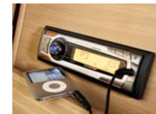
Radio/CD/MP3 player Radio/Cd/MP3 player with iPod/MP3 player connection