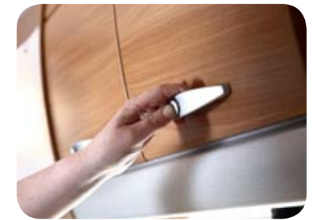
Positive door catches Positive catches on all overhead locker doors provide secure storage, even whilst on the move