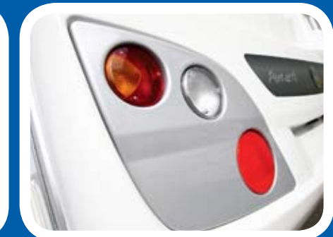
Rear lights Stylish rear light clusters