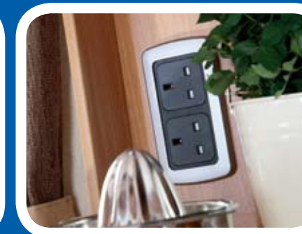
More mains sockets Models now feature five 230V sockets to meet modern power demands