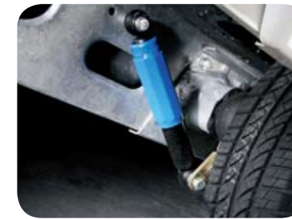
Shock absorbers Shock absorbers give more stable, smooth towing