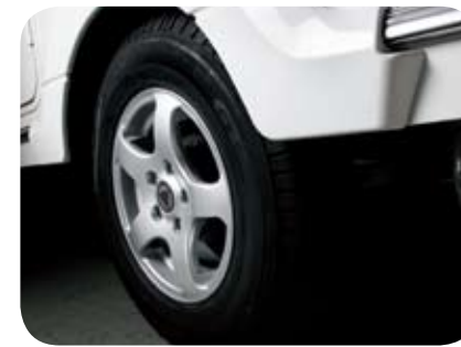
Alloy wheels Stylish alloy wheels with receiver for AL-KO Secure portable wheel lock