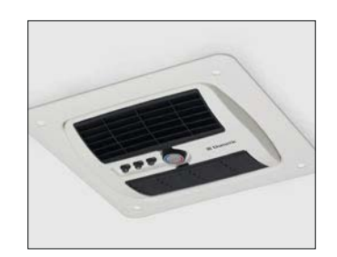
Optional Dometic air conditioning