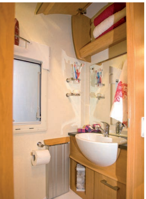
Buccaneer's wow-factor continues with show-stopping new bathrooms, complete with tiled effect showers and stylish cool accessories. Home comforts feature highly, with touches such as heated towel rails, a ceramic toilet and domestic style doors. With space to pamper and lots of clever storage, these are bathrooms that truly take caravanning to a whole new level of luxury.