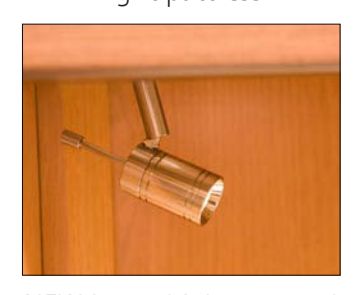
NEW Lumo high-powered LED Stem Reading Lights