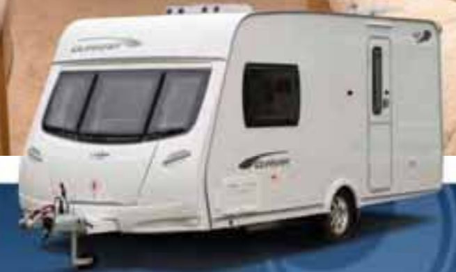
Quasar 544 - Luxurious Fixed Bed and Spacious End Washroom