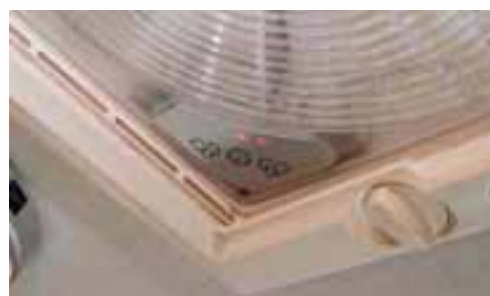
Premium Quality Fittings New High Capacity Microwave New Touch Control Clear Extractor Fan/ Roof Light