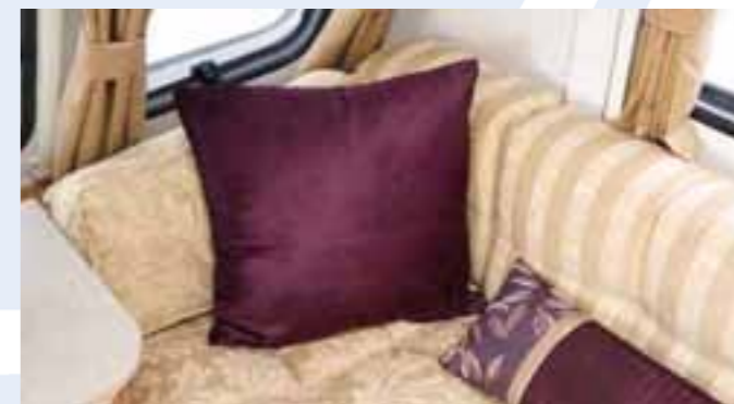
Clubman/ Delta – 'Stanton'

(curtains/scatter cushions match the range standard fabric)