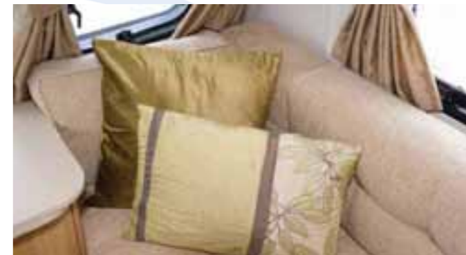
Ariva / Quasar – 'Mazurka'

The L shaped layout option is available as a special order (at an additional charge) on selected models.