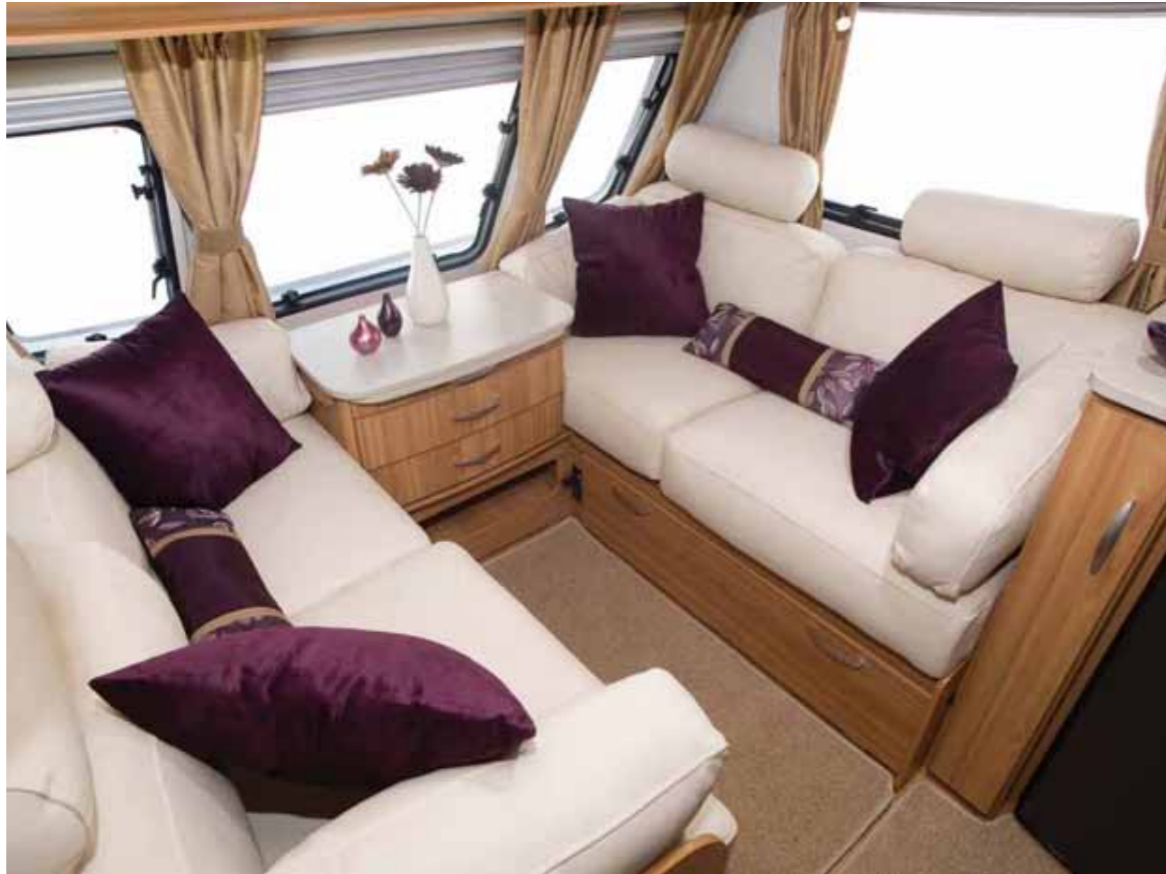
Clubman SI – Sumptuous Leather Upholstery Option