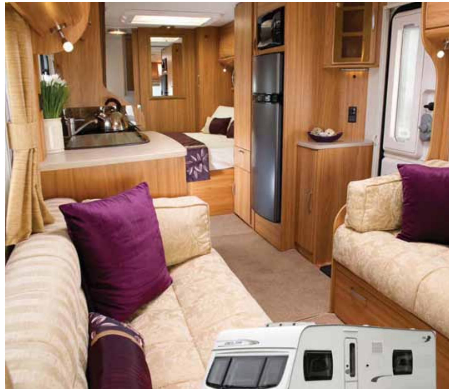
Delta TI - The Finest in Open Plan Luxury Living