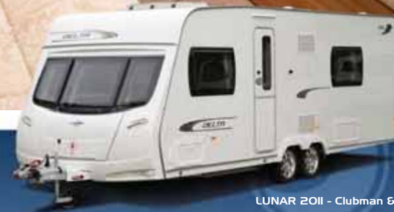
LUNAR 2011 - Clubman & Delta