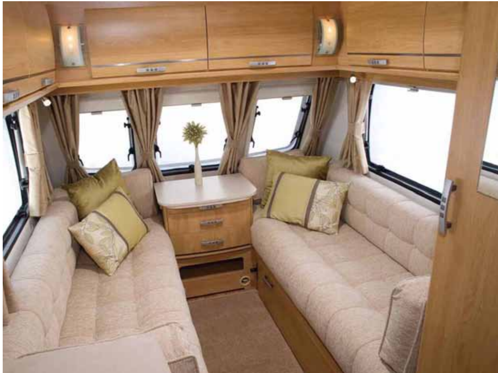
New 'Mazurka' Soft Furnishings, 'Kanji' Wall and Ceiling Board, 'Velvet' Work Surfaces