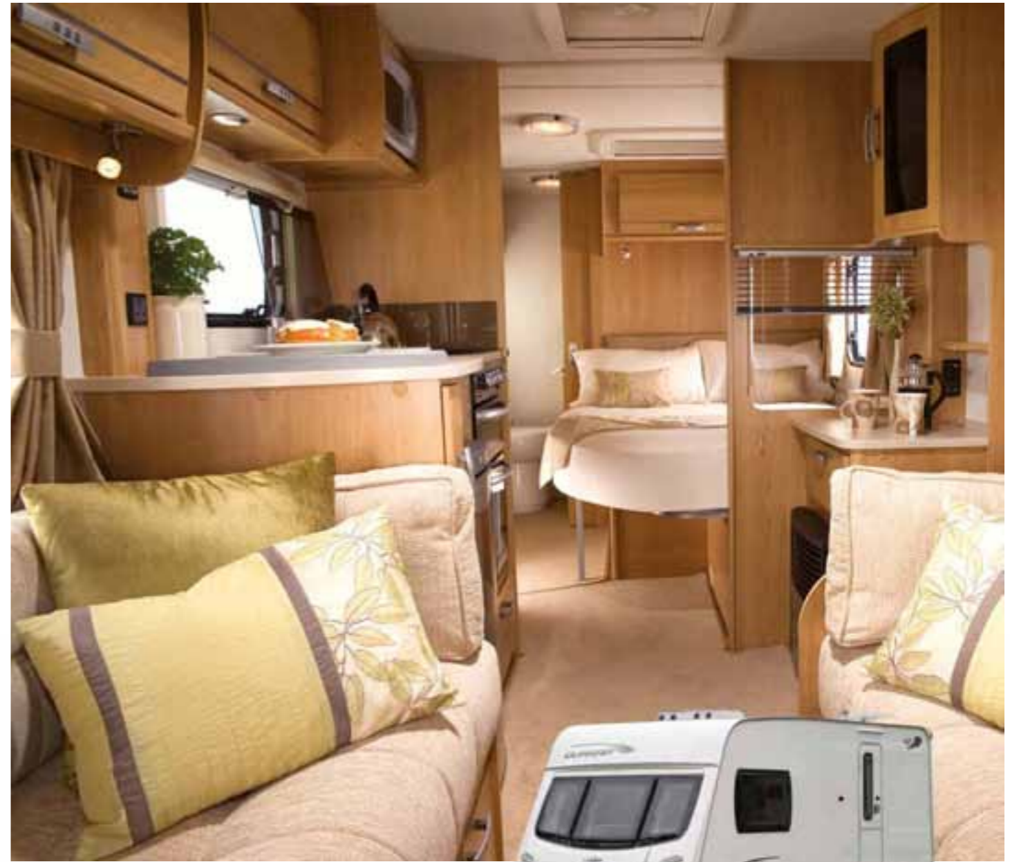
New Bronze Enamel Sink with Separate Drainer Quasar 462 - Spacious Living Area Quasar 546 - Fully Equipped Kitchen Brushed Silver Handles