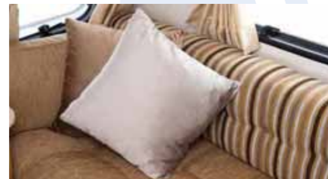
Lexon / Stellar – 'Victoria'