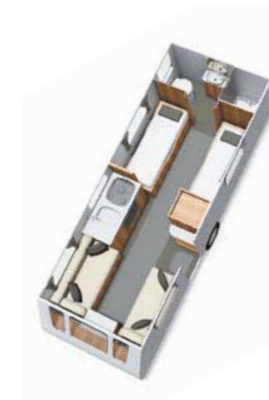
Xplore 574 Single Axle | 4 berth