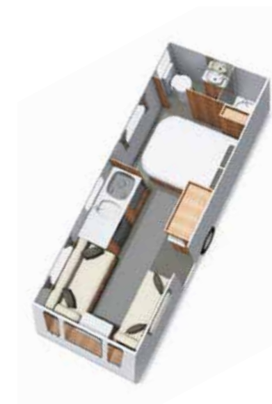
Xplore 554 Single Axle | 4 berth