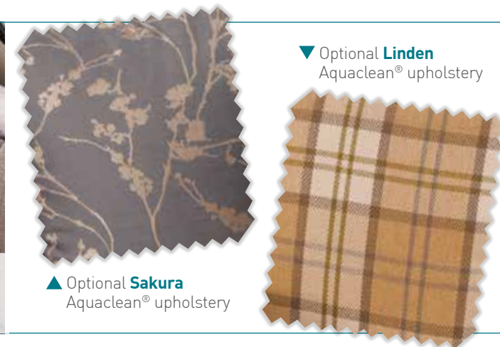
▼ Optional Linden Aquaclean® upholstery