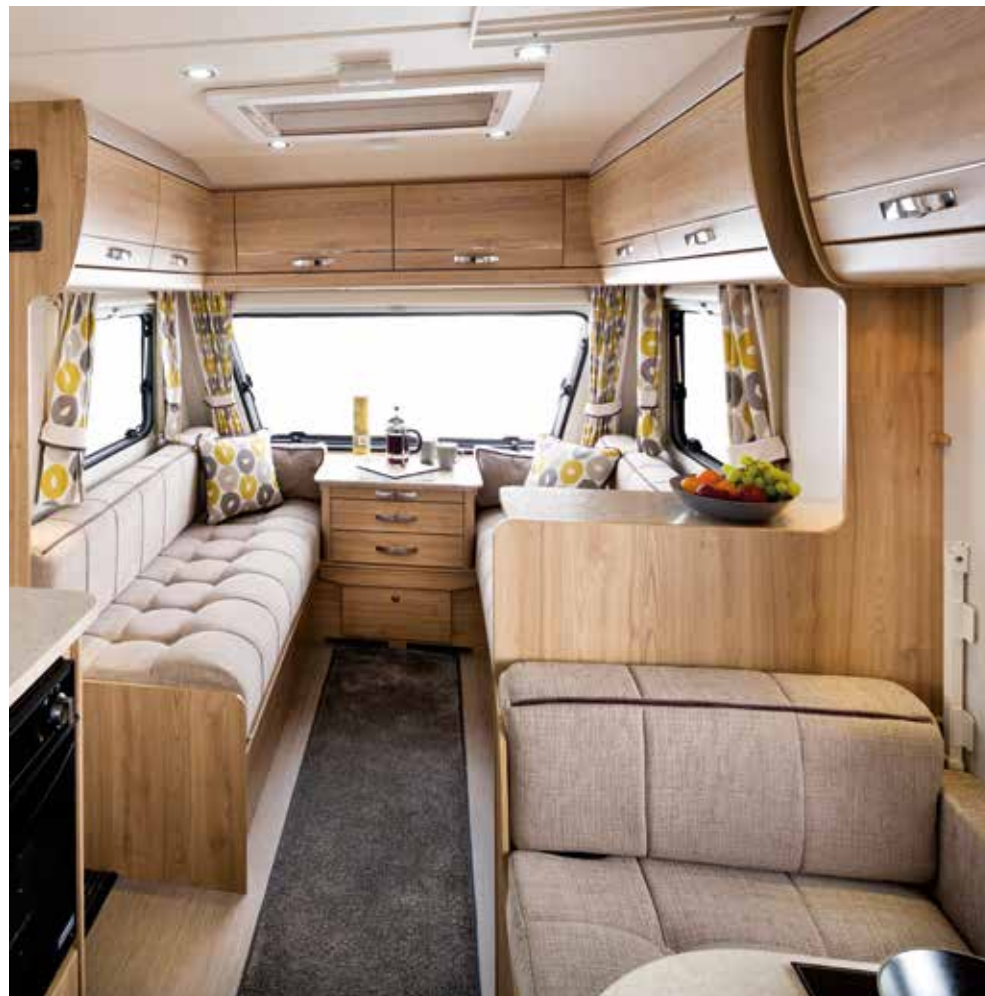
'Marone' craftsman-built cabinetry with dove-tailed drawers and Easy-Glide bed slats