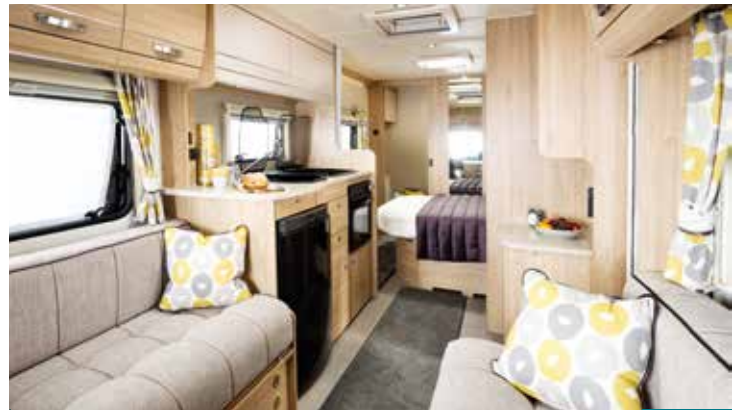
Model shown: 554 new