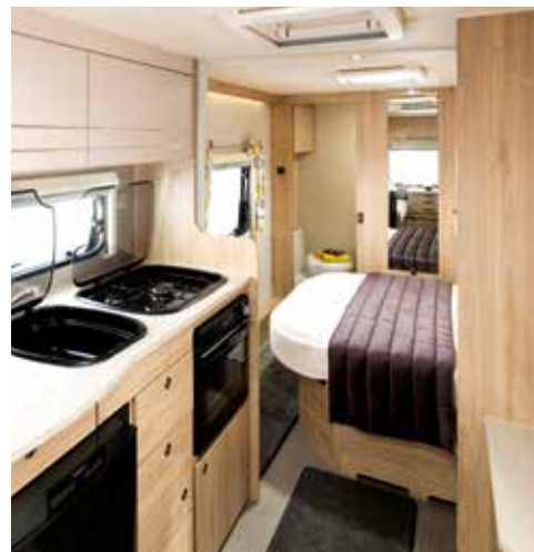
Island bed (554) retracts to give 40cm extra floorspace