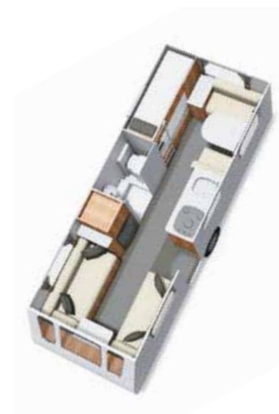
Xplore 526 Single Axle | 6 berth