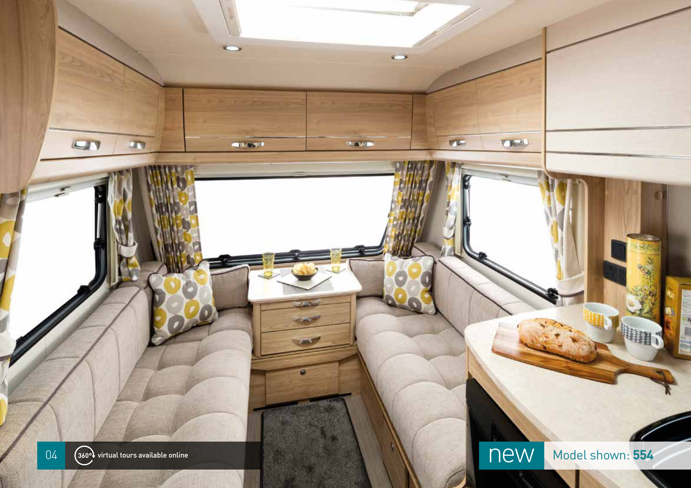
new Model shown: 554