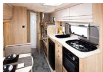
Model shown: 586