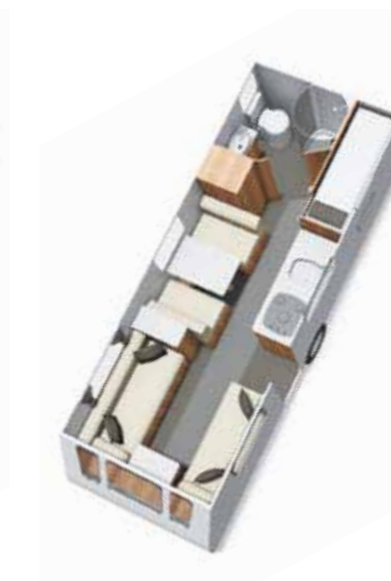
Xplore 586 Single Axle | 6 berth

▶ For prices, options and technical specifications go to www.elddis.co.uk