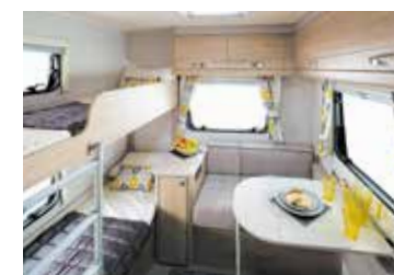
Model shown: 526