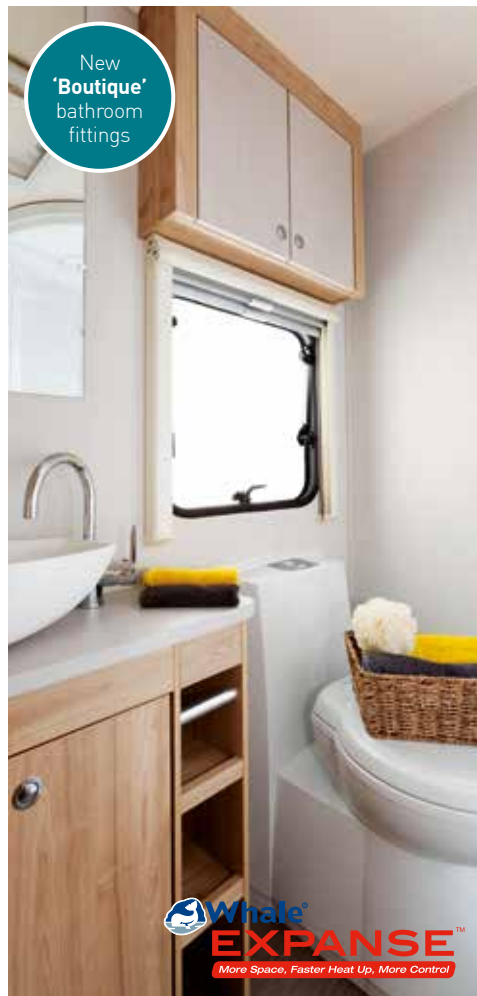
New 'Boutique' bathroom fittings