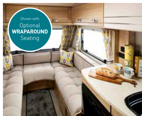
Shown with Optional WRAPAROUND Seating