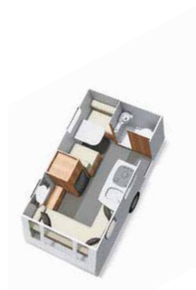
Xplore 304 Single Axle | 4 berth