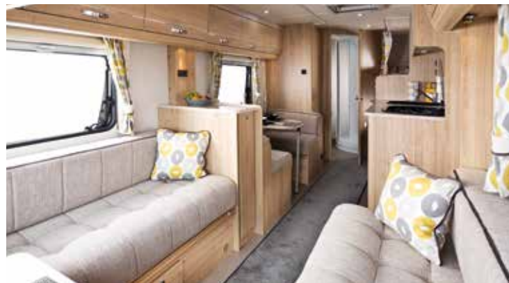
Model shown: 586