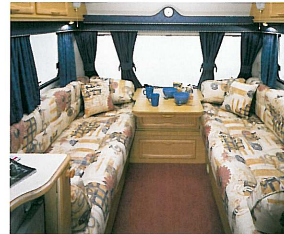
Rialto lounge in Springtime upholstery