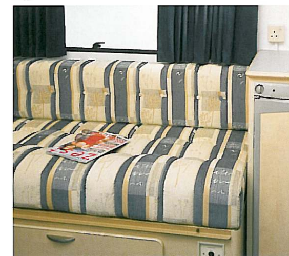
Argente in Malmö upholstery