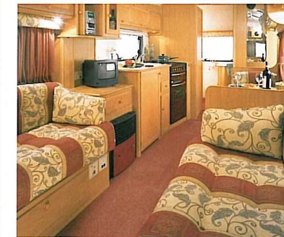
Land-Ranger 5500 S in Concerto upholstery