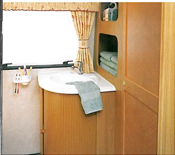
Land-Ranger 5500 washroom

Land-Ranger - the definitive twin axle tourer!