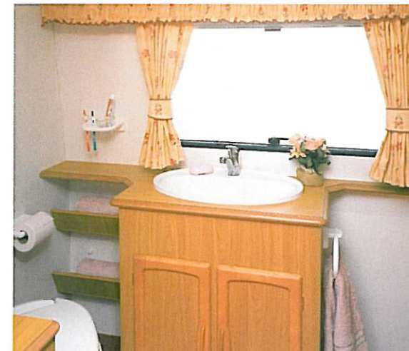
Rialto 550-4 washroom