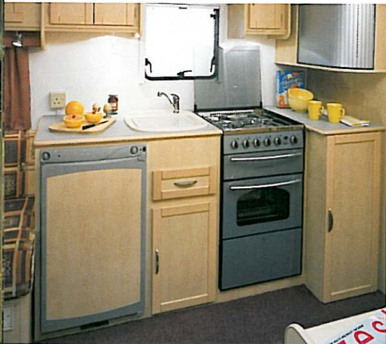
Argente 555-4 kitchen