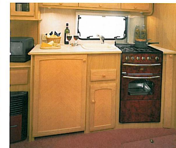
Land-Ranger 5500 kitchen