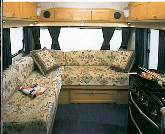
Land-Ranger 6400 EWL in Saffron upholstery