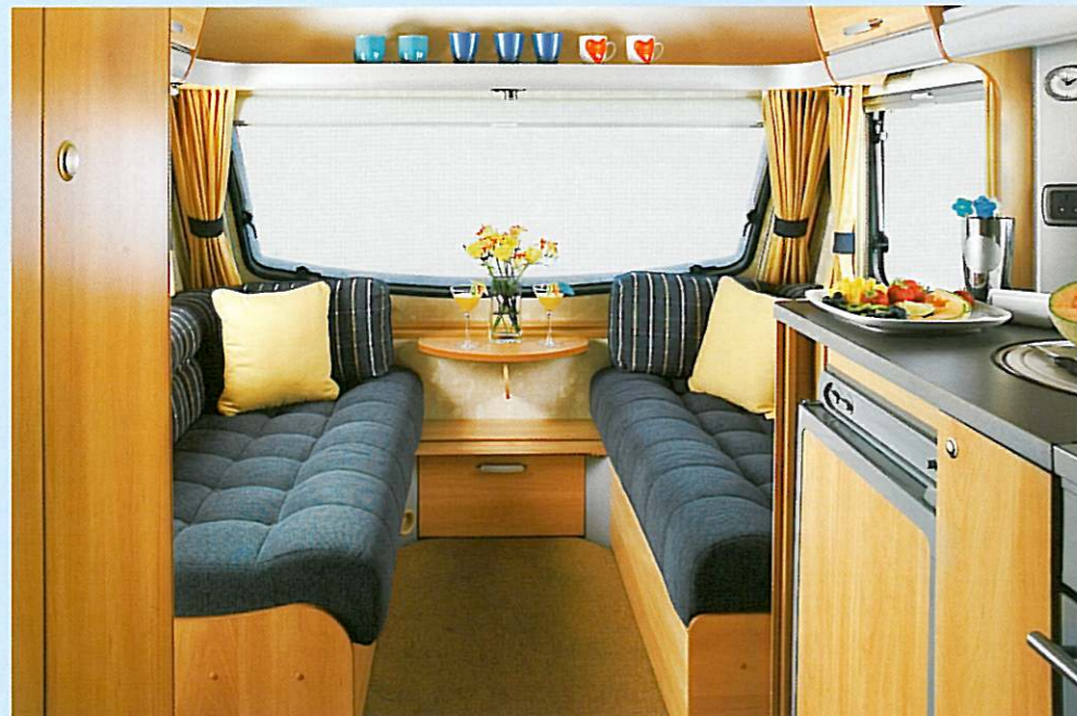
Musketeer - optional end bolster cushions shown