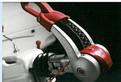
Optional AL-KO AKS 3004 stabiliser