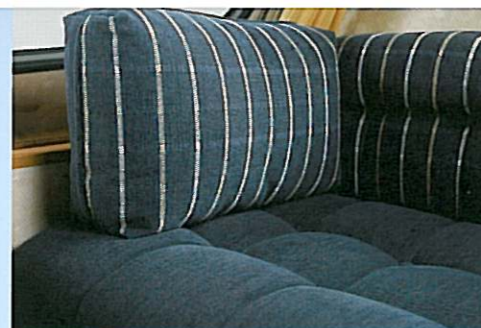
Optional bolster cushions