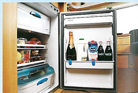
Fridge with full width freezer

The Scandinavian blue and silver soft furnishing scheme with contrasting scatter cushions creates a comfortable and relaxing lounge and dining area. Loose-fit carpets over wood block effect vinyl flooring enable easy cleaning and there is a freestanding dining table with its own dedicated storage area for when it's not in use.