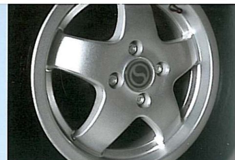
Optional alloy wheels