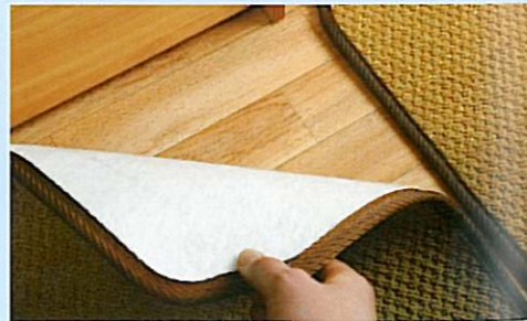
Loose fit carpets over wood block effect vinyl floor