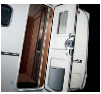
Entrance door and full height flyscreen