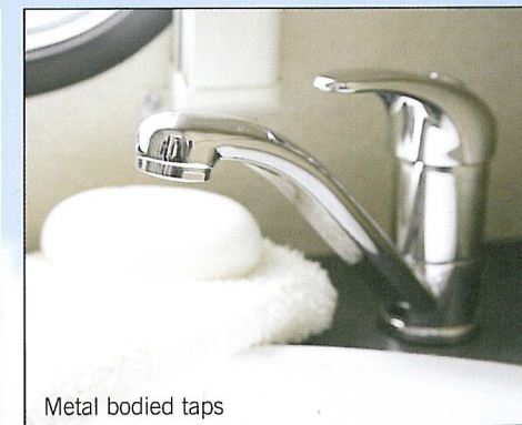
Metal bodied taps