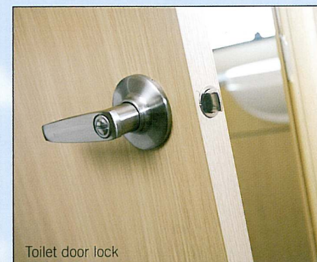
Toilet door lock