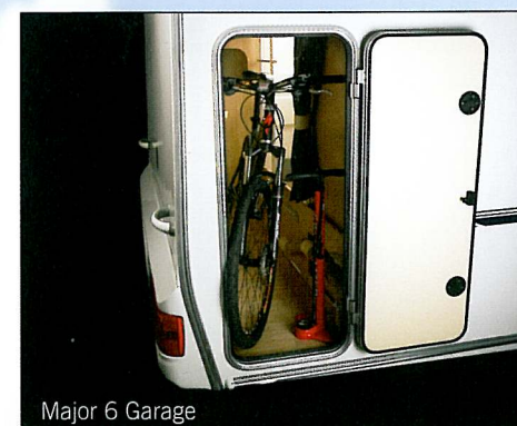
Major 6 Garage