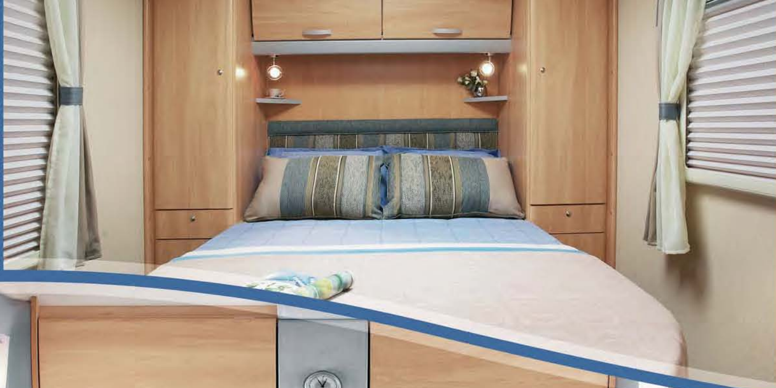
Below - Elite Explorer