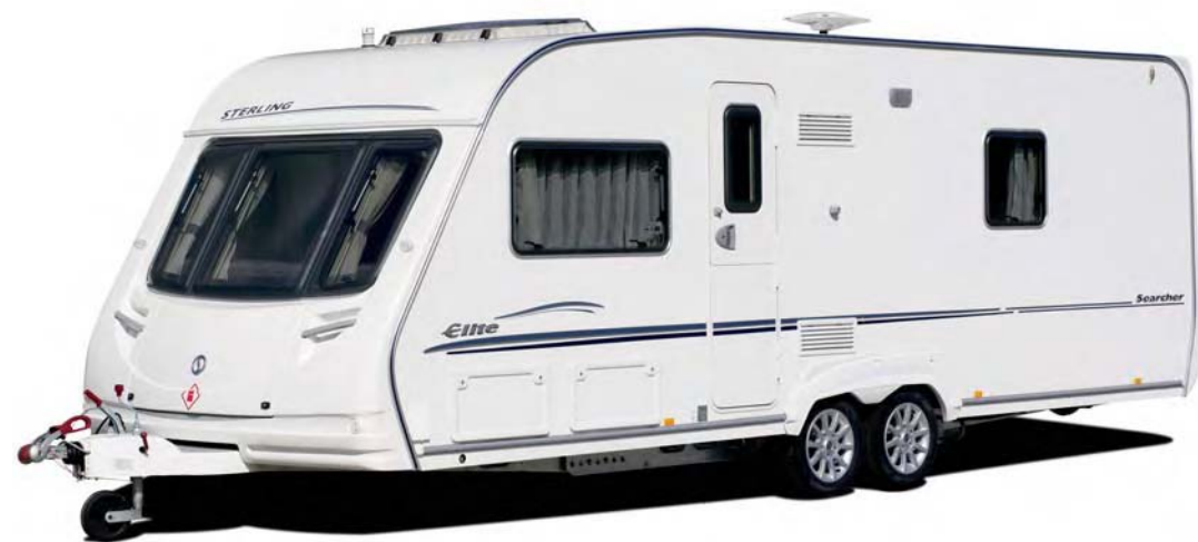
Right - Elite Searcher

All Elite twin-axle models now benefit from a 7'6" width making the Scandinavian inspired interiors even more spacious especially around fixed beds and in the central floor area. The Overlander four-berth with fixed twin beds and end washroom is the latest addition to the range.