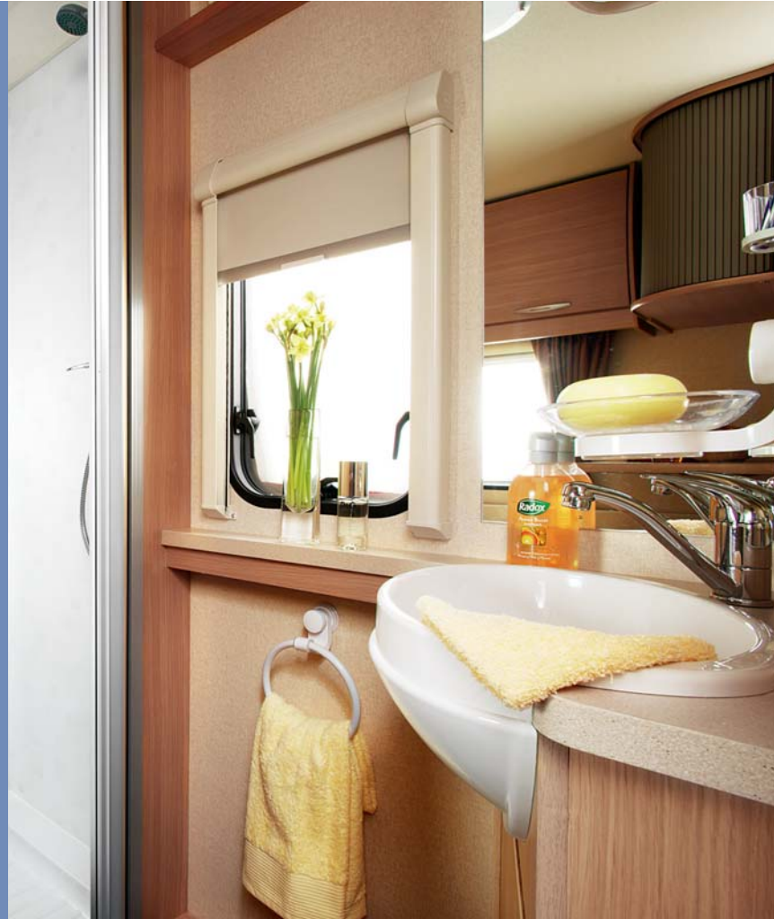
Above: Vogue 470