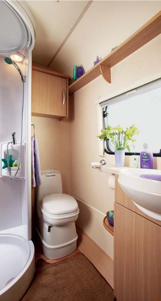
Above: Vogue 600