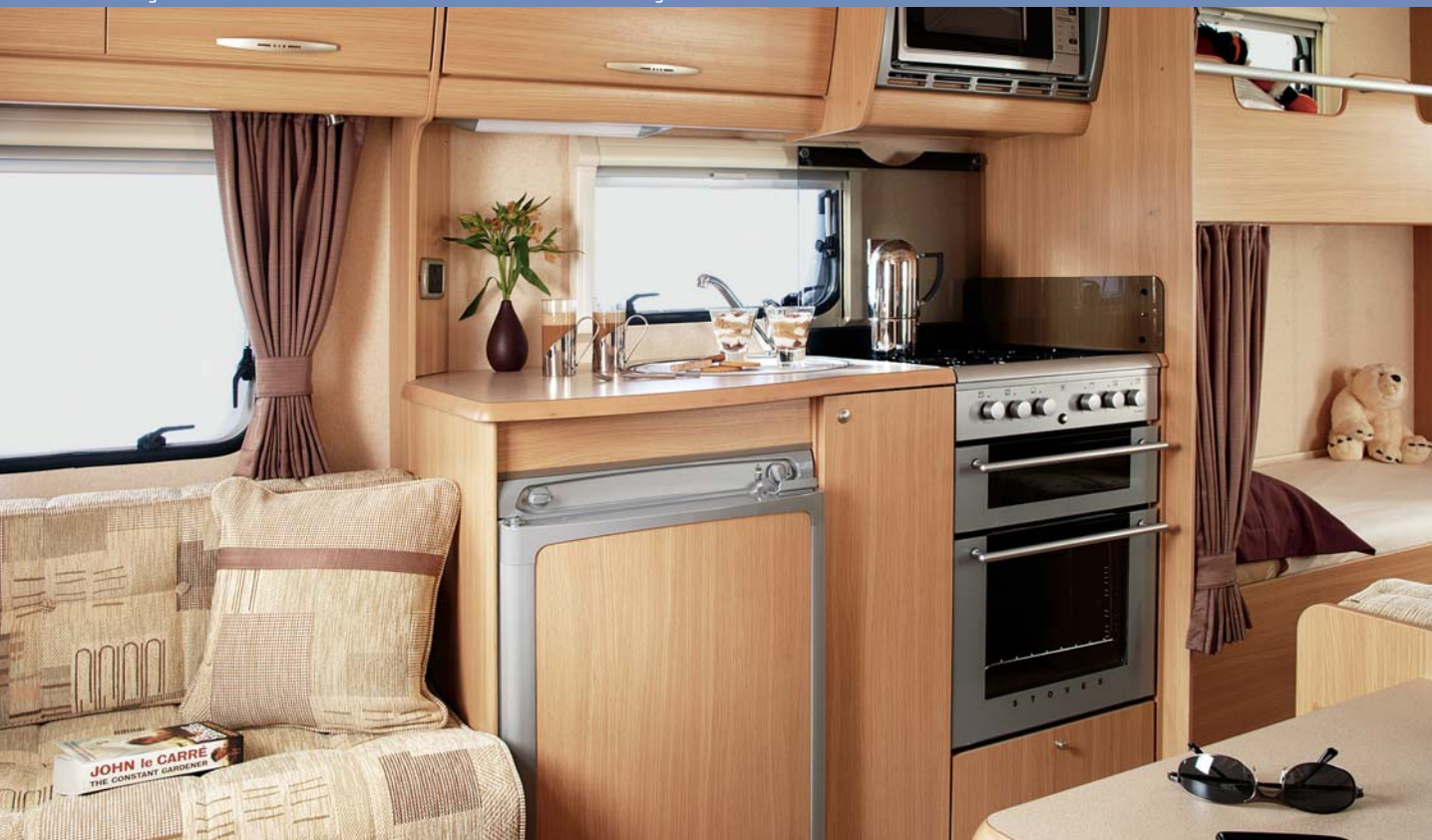
Above: Vogue 600

Exteriors offer one-piece, thick gauge, high gloss, aluminium sidewalls, 6'5" headroom and on some models, 7'6" wide bodyshells, while alloy wheels and a Status 530 directional TV aerial come as standard.