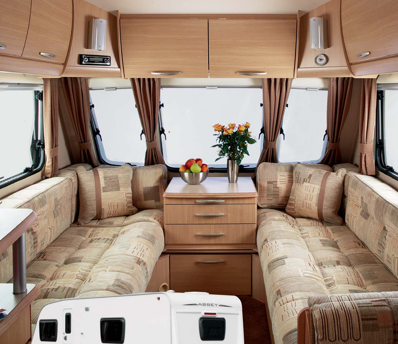
Left: Vogue 620