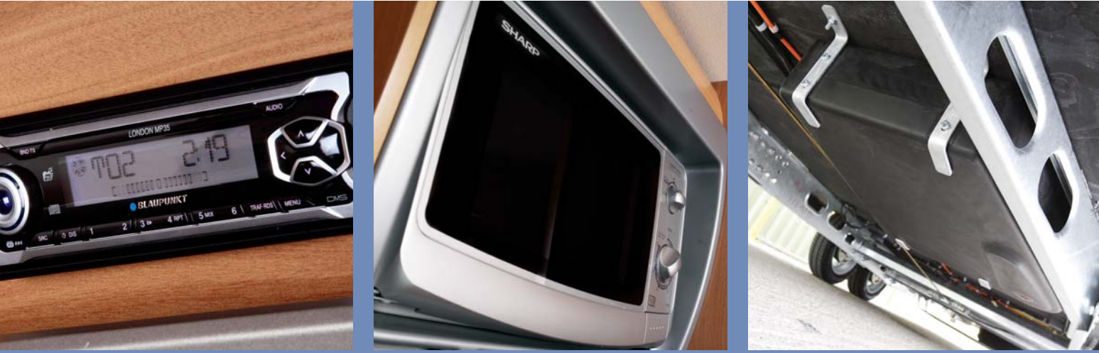
Above: Radio/CD/MP3 Player (optional extra)