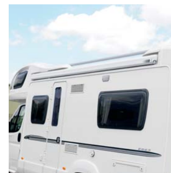
Full length recessed awning (part of optional Elegance Pack)