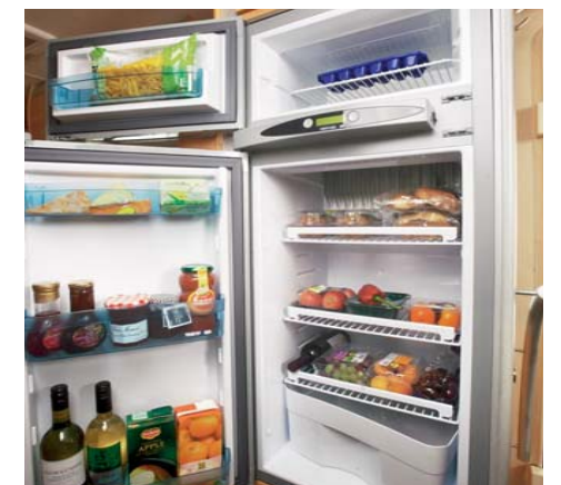
Above: E665 Right: 175 litre fridge/freezer

Other class-leading features include en route and on site central heating from the dual-fuel Truma 'Combi' Boiler and remote central locking entrance doors.