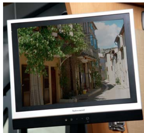
Right: 15" flatscreen TV part of optional Elegance Pack

High specification exteriors incorporate a full GRP luton, rear panel and roof with integral roof bars and a recess in the roof for an optional roll-awning. For even more high specification features add the high value Elegance option pack.