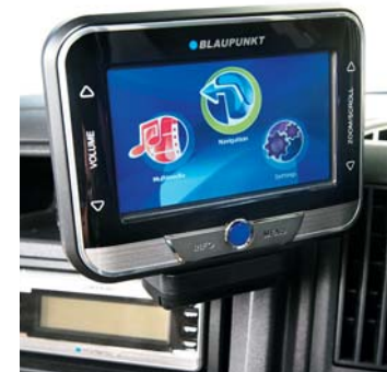
Blaupunkt TravelPilot Lucca 5.2 portable navigation and entertainment unit (part of optional Elegance Pack)