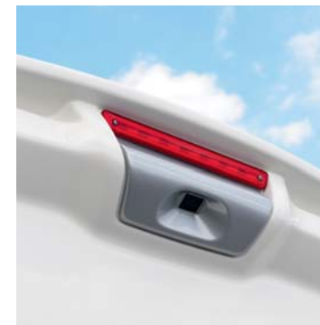
Colour reversing camera (part of optional Elegance Pack)