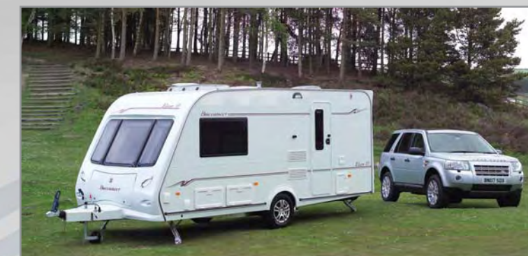
Buccaneer Elan 15