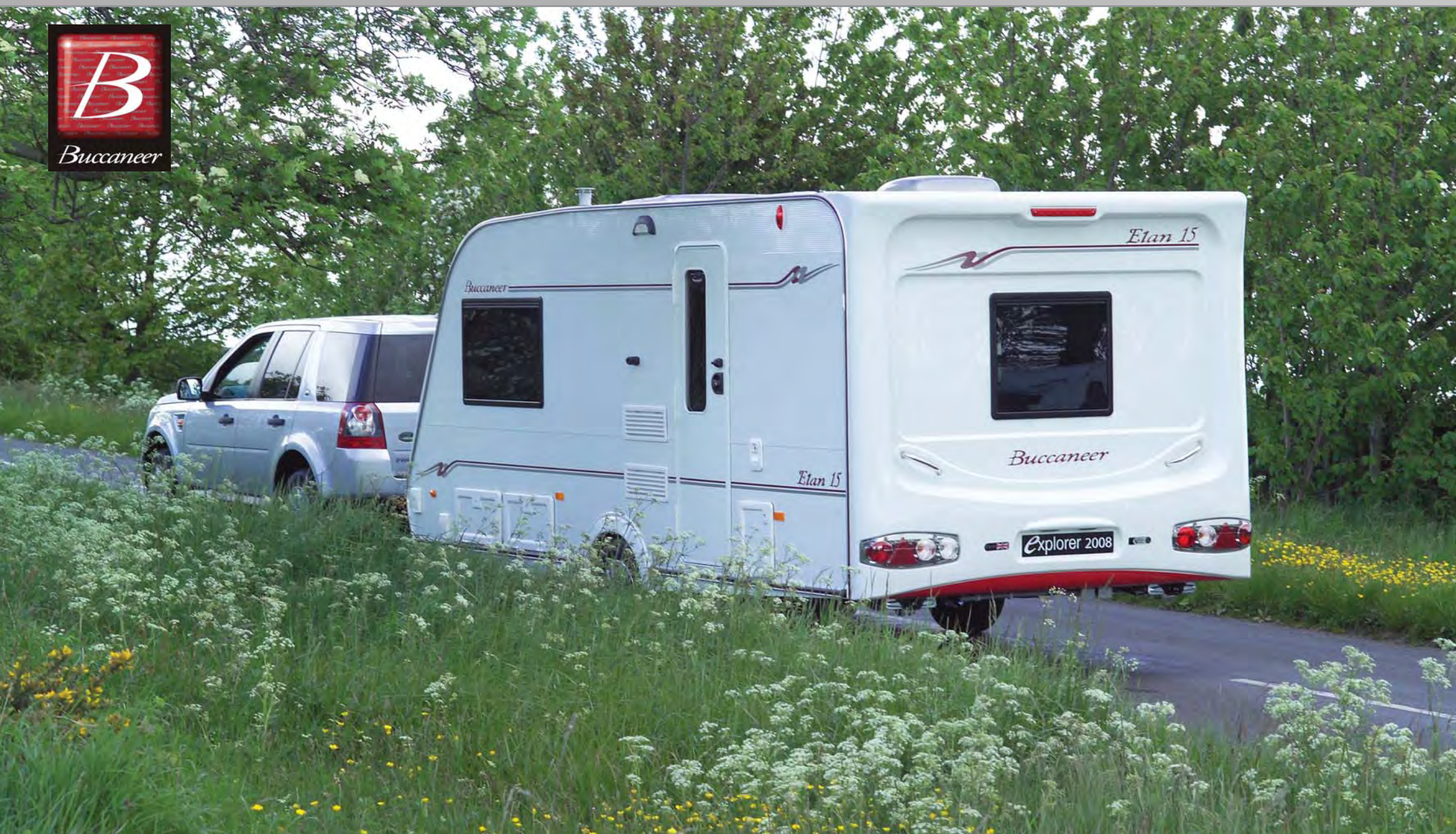
Buccaneer Elan 15