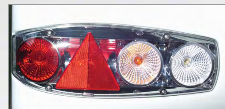
Buccaneer Rear Light Cluster