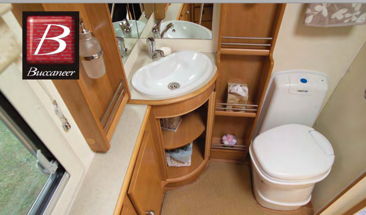
Buccaneer Elan 15