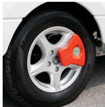
AL-KO wheel lock