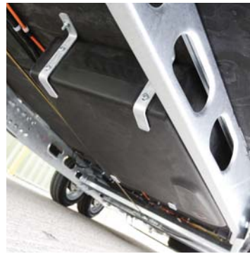
Insulated water tank