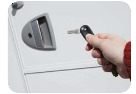
High security lock Security is enhanced with a high security entrance door lock with flipper style key