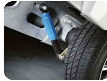
Shock absorbers Shock absorbers are fitted to all new models giving more stable smooth towing