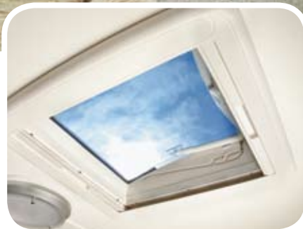
Mini Heki Clear mini Heki rooflights in both the living and bedroom areas provide additional natural light