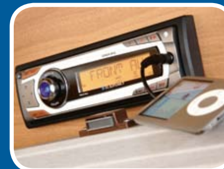
Radio/CD Radio/CD/MP3 player with iPod/MP3 player connection