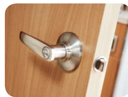
Washroom door Thick washroom door with domestic style lock and handle.

Washrooms have been much improved with lined showers and new Thetford toilet with wheeled waste tank in all models. The Ambassador and Globetrotter feature the new walk in shower with separate drying area.