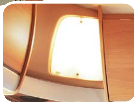
Mains lights Stylish front locker design with recessed mains lights