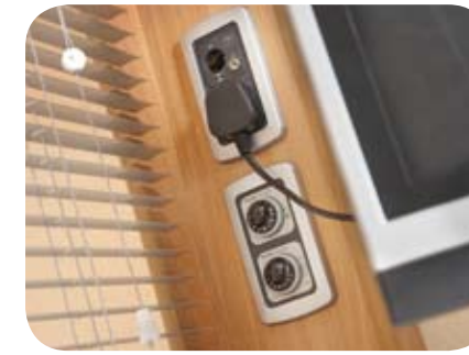
TV/electrical points All models now have three 240V sockets and a 2nd TV point near the front or rear chest