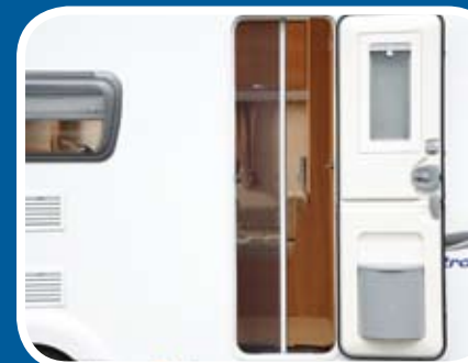
Concertina flyscreen Entrance door has an easy action concertina door flyscreen