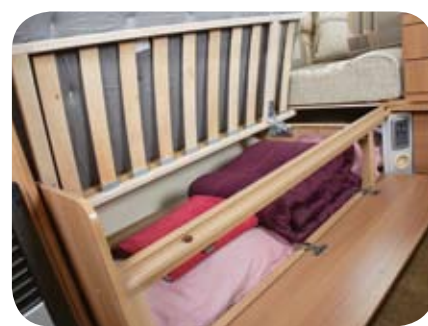
Unique seat bases Beech slat seat bases provide comfortable seating whilst sprung hinged tops and full-length front flaps provide easy access to under seat storage