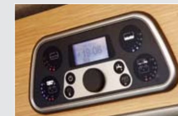
Control panel The new 12V control panel over the doorway has touch controls with an analogue display