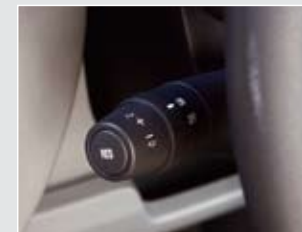
Optional Elegance pack The optional pack now consists of cruise control, cab air-conditioning, colour reversing camera and latest portable satellite navigation unit.