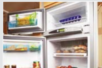
Fridge/ freezer 175 litre or 104 litre Smart Energy Selection fridge/ freezer (model specific)

Fully equipped kitchens come with a microwave oven as standard, glass fronted electronic ignition oven and grill with dual fuel hob and a large fridge freezer. Washrooms are equally well specified with separate shower areas, electric flush toilet and a wash basin integrated into a useful cupboard unit. Other class leading features include seat tops with gas struts for easy access and the dual fuel Truma 'Combi' central heating system which ensures effective heating both en-route and on site. A new option is a winter pack consisting of fresh and waste water tank heaters and a winter fridge vent cover.