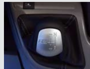
Auto gearbox Optional Comfort-Matic automatic gearbox available with 160bhp engine