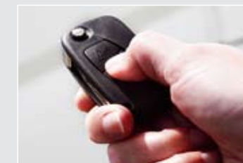
Central locking Remote central locking of cab doors and entrance door

Classic exterior styling and luxurious and spacious interiors combine to ensure the E600 range provides the ultimate in motorhome touring in this market sector. Offering one new layout, the E600 range now comes with a choice of two new fuel saving, low-line models with panoramic opening 'Skyview' roof window and spacious over cab lockers in addition to two high-line models. All models also now feature a recessed awning as standard.