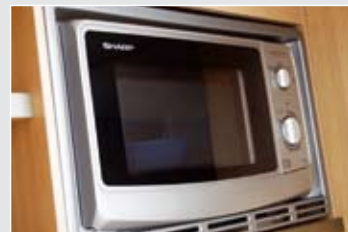
Microwave Well equipped kitchens provide a microwave oven as standard