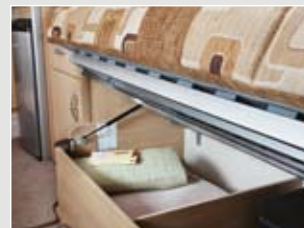
Seat tops Seat tops with gas struts for easy access