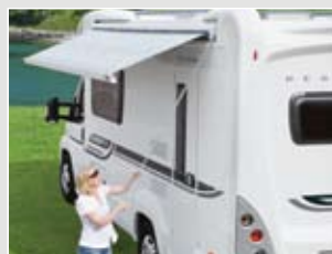
Awning Full-length recessed awning now comes as standard

Classic exterior styling and luxurious, spacious interiors combine to ensure the new E600 range provides the ultimate in motorhome touring in this market sector. The Fiat 4 tonne Maxi Chassis offers generous payloads for all the holiday essentials and powerful Fiat diesel MultiJet engines with an automatic option provide car like driving qualities. New to all layouts is energy saving LED lighting which contributes to a 70% reduction in lighting power consumption. This prolongs battery life, making it realistic to power the system from a solar panel, for which there is now roof and wiring preparation.