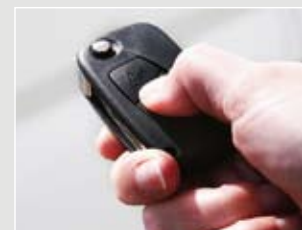
Central locking Remote central locking of cab doors and entrance door