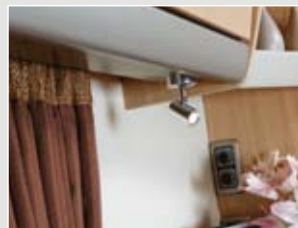
LED lights LED lights are long lasting and more energy efficient

Fully equipped kitchens feature new appliances with a built in microwave oven, stainless steel effect electronic ignition fridge, Thetford oven and dual fuel hob. Washrooms are equally well specified with all models featuring a separate fully lined shower area, a wash basin integrated into a useful cupboard unit, the latest Thetford toilet and a thick door with domestic style lock and handle. Other class leading features include seat tops with gas struts for easy access and the dual fuel Truma 'Combi' central heating system which ensures effective heating both en-route and on site.