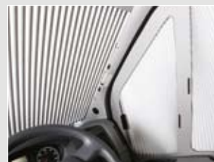
Cab blinds Smart pleated cab blinds provide shade and privacy