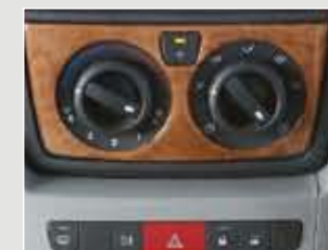
Optional Elegance pack The optional pack consists of cruise control, cab air-conditioning and a colour reversing camera with image shown on rear view mirror