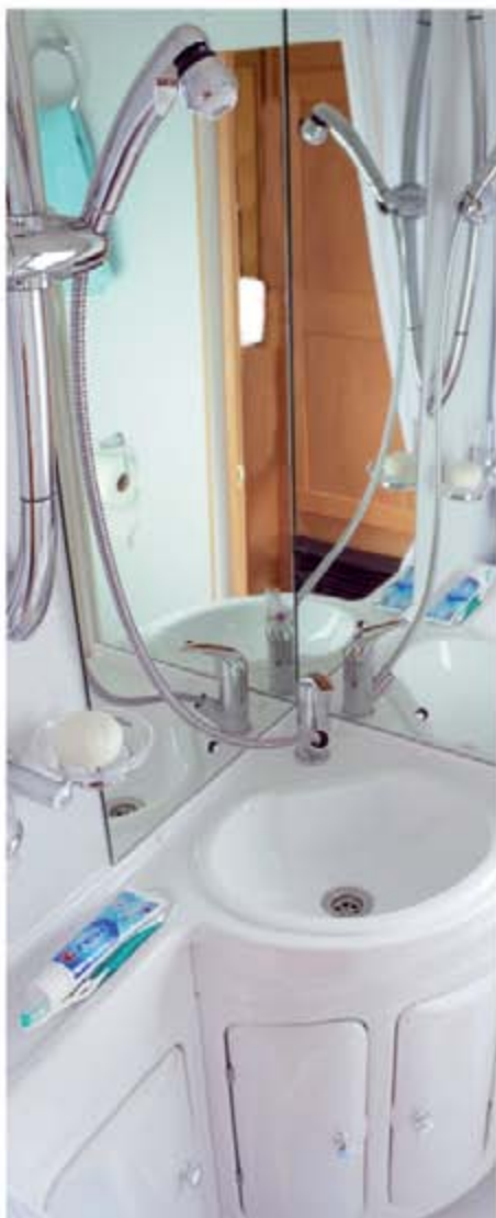
Autoquest 180 bathroom