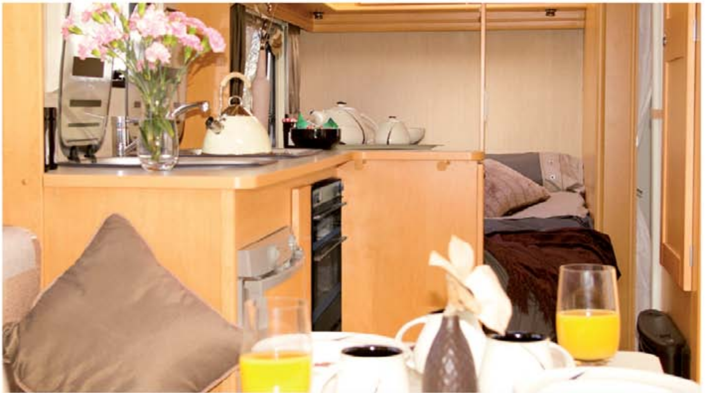
Autoquest 155 with sumptuous fixed bed