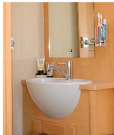
Autoquest 155 vanity unit