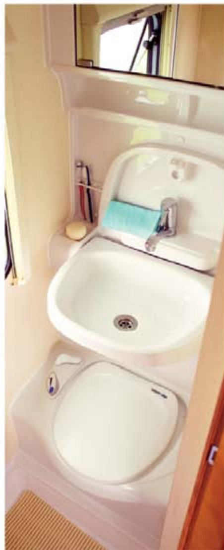
Bench toilet and tip-up hand basin