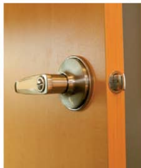
New domestic-style door