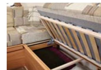
Beech slatted seat top Spring assisted for easy access

Inside is equally well appointed with furniture in Tanganyika medium walnut finish which tones perfectly with a warm beige and grey fabric scheme. Good storage is provided with beech slatted seat tops being sprung assisted for easy access to storage areas below (except travelling seats). Well-equipped kitchens offer an 80 litre fridge and a combined thermostatic oven and grill, both with electronic ignition. Washrooms have a 35mm thick entrance door with domestic style mortice lock and handle plus the latest Thetford C250 toilet with electric flush and wheeled holding tank.