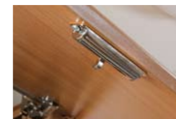
Positive catches Positive catches on all furniture doors provide secure storage, even whilst on the move

Inside is equally well appointed with furniture in Tanganyika medium walnut finish which tones perfectly with a warm beige and grey fabric scheme. Good storage is provided with beech slatted seat tops being sprung assisted for easy access to storage areas below (except travelling seats). Well-equipped kitchens offer an 80 litre fridge and a combined thermostatic oven and grill, both with electronic ignition. Washrooms have a 35mm thick entrance door with domestic style mortice lock and handle plus the latest Thetford C250 toilet with electric flush and wheeled holding tank.