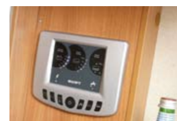
Control Panel The 12V control panel controls the 12V power on/off, water pump and lighting circuits, tank levels and leisure battery state

Based on the Fiat Ducato, the Escape comes with a 100 MJ engine as standard which provides class-leading power and performance for this low weight range. The cab is dark Imperial Blue with complementary Escape graphics to the gloss white one-piece, thick gauge aluminium side walls which are finished with GFR moulded skirts and ABS lower rear panel with stylish light clusters to give an overall striking appearance. The cab offers the high level of specification you would expect from a quality coachbuilt motorhome.