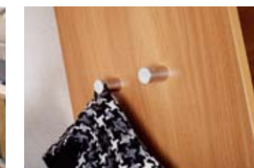
Stylish Coat Hook Thoughtful finishing touches for everyday living