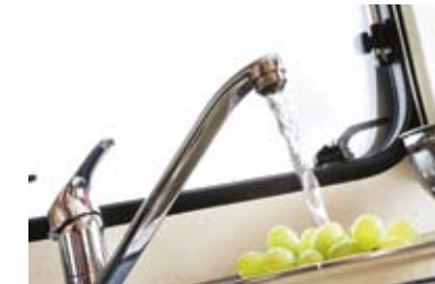
Brass taps Reliable high performance water supply