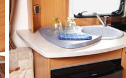
Granite look kitchen sink With separate removable drainer