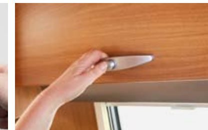
Positive locker catches On kitchen lockers for secure storage on the move