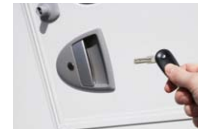
High security lock Enhanced security complete with flipper style key