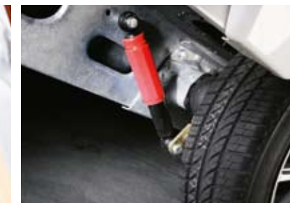
Shock absorbers Give more stable, smooth towing