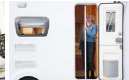
Concertina door Entrance door has an easy action concertina door flyscreen