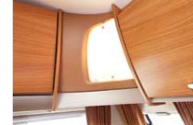
Corner light Stylish front locker design with integral corner lights

Awning sizes: Due to the varying awning designs and sizes the awning sizes given are approximate only. Specific awning sizes must be confirmed by your dealer or the awning manufacturer prior to purchase.