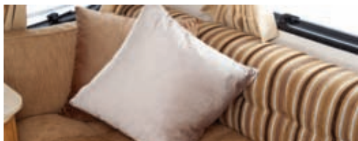
Lexon / Stellar – 'Victoria'