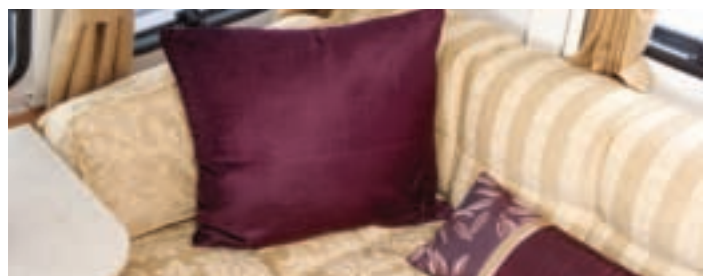
Clubman/ Delta – 'Stanton'