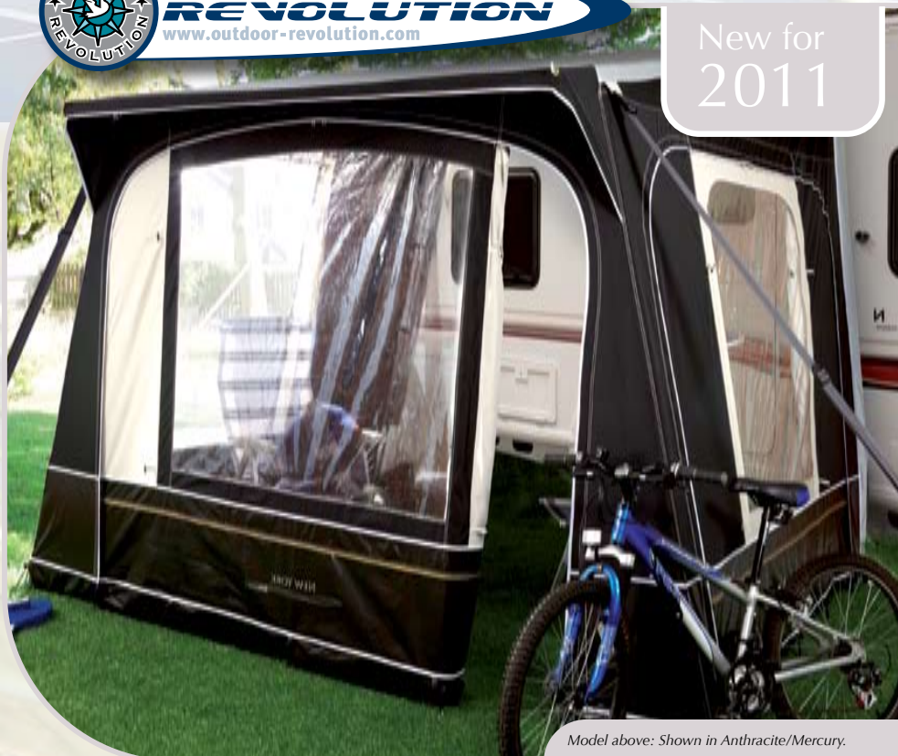
Model above: Shown in Anthracite/Mercury.

Available in our new contemporary and exclusive colourway, anthracite and mercury, cool and unobtrusive on any campsite and designed to match many modern caravans. This will be our most popular porch this season.