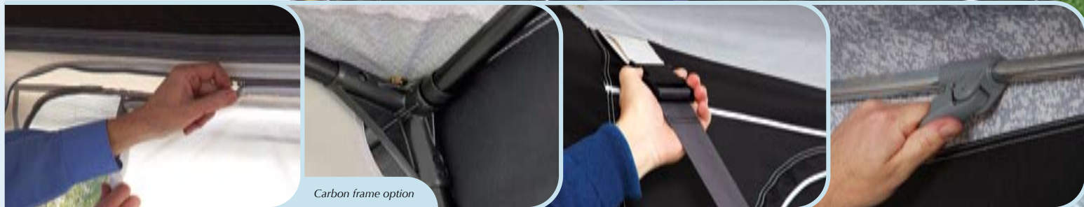
Carbon frame option