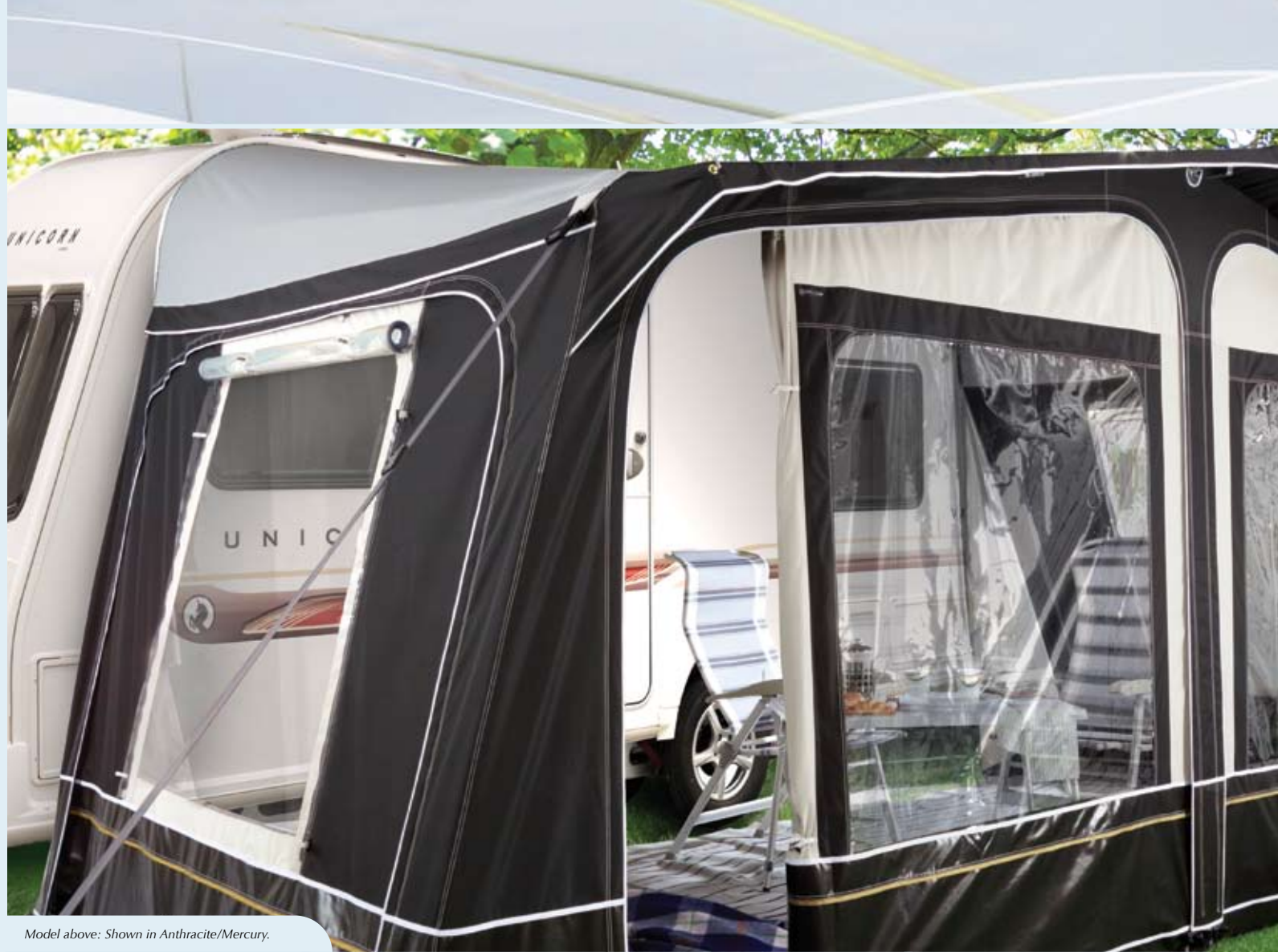
Model above: Shown in Anthracite/Mercury.