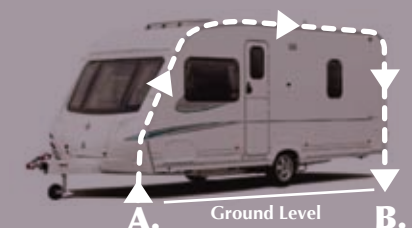
A. Ground Level B.

If unsure, please contact one of our specialist dealers for advice or email our technical enquiries department on: cuserv@blue-diamond-products.co.uk