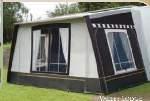
VALLEY LODGE DRIVE AWAY