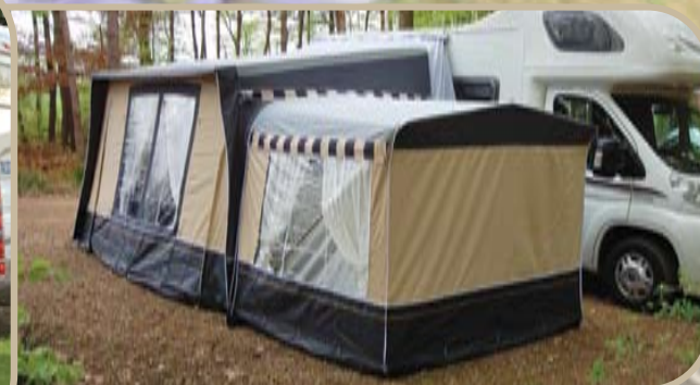
Inset above: Optional Tall Annexe.