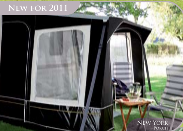
NEW YORK PORCH