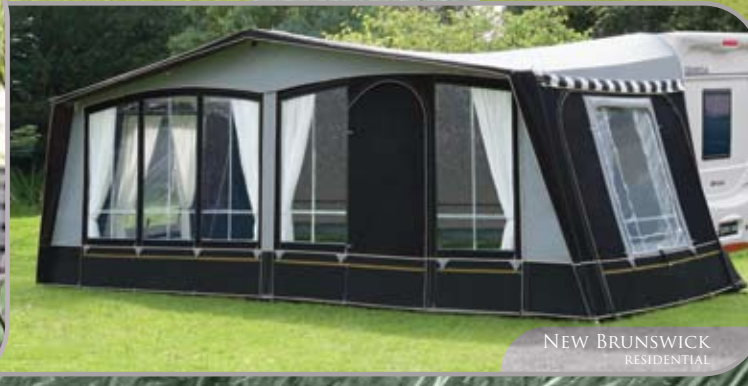
NEW BRUNSWICK RESIDENTIAL