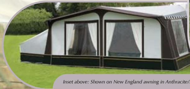
Inset above: Shown on New England awning in Anthracite/Mercury.

The Standard Annexe is an excellent compliment to the New Wave range. It fits any of the models in this catalogue to create extra sleeping or living space. Available in Blue Graphite/Sand and Anthracite/Mercury.