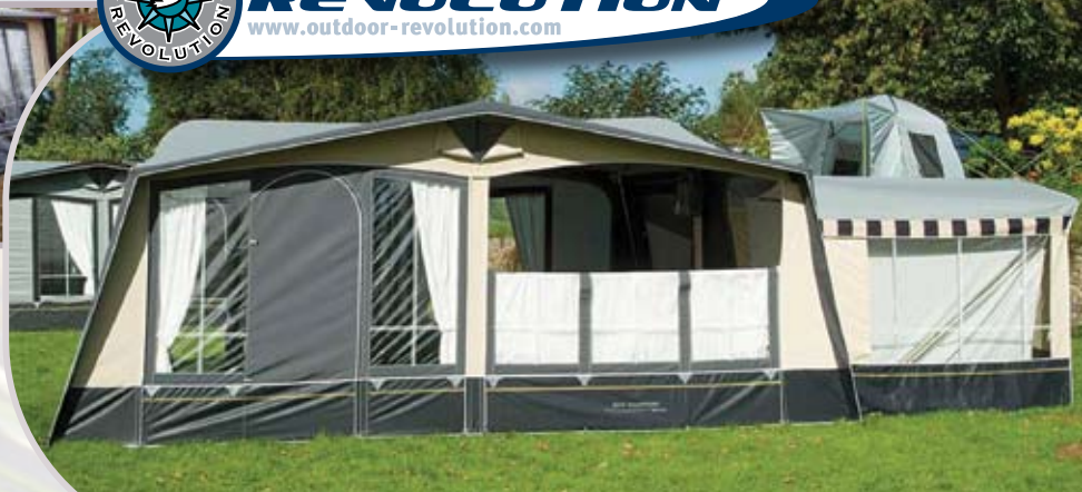
Inset above: Shown on New Hampshire awning in Blue Graphite/Sand.