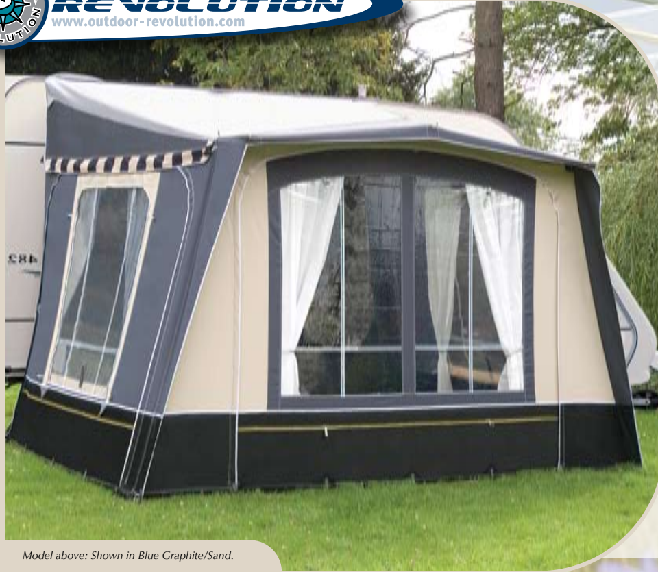
Model above: Shown in Blue Graphite/Sand.