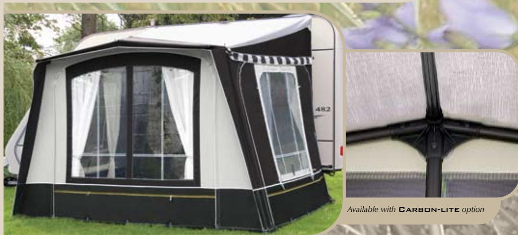
Inset above: Shown in Anthracite/Mercury.

The Vermont is available in the new up to the minute colourways: Anthracite/Mercury or Blue Graphite/Sand. Also available for this superb porch is the new CARBON-LITE frame, making it even easier and lighter to erect. Stunning looks and packed with quality features, at a value for money price, this is a revolutionary new model from the Outdoor Revolution stable.