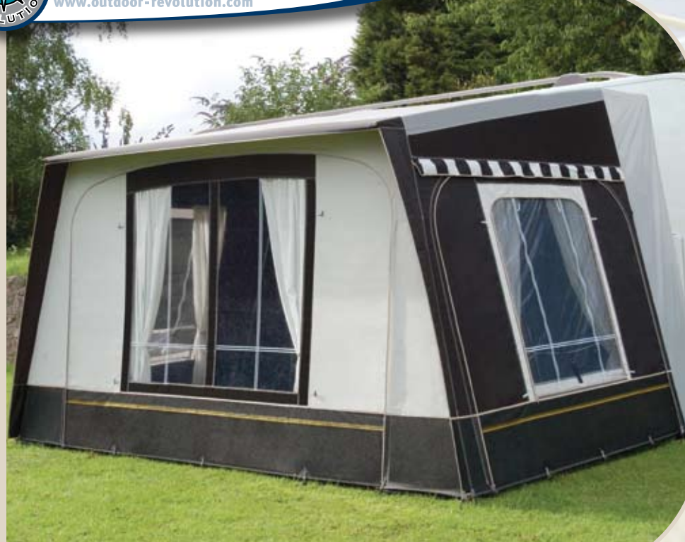
Model above: Shown in Anthracite/Mercury.

The Valley Lodge is the largest Motor Home awning available on the uk market, another first for Outdoor Revolution. With a floor area of 3.8m wide x 2.5m deep together with an Annexe you can create a huge light and airy living space for the family, packed with features, a superb quality awning at a value for money price.