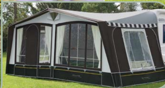
Model above: Shown in Anthracite/Mercury.