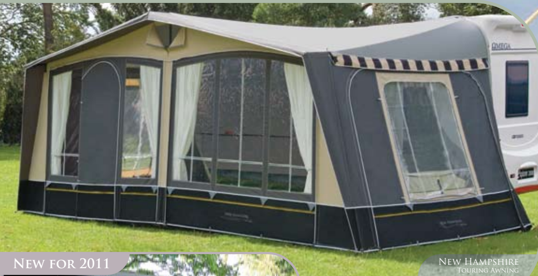
NEW HAMPSHIRE TOURING AWNING