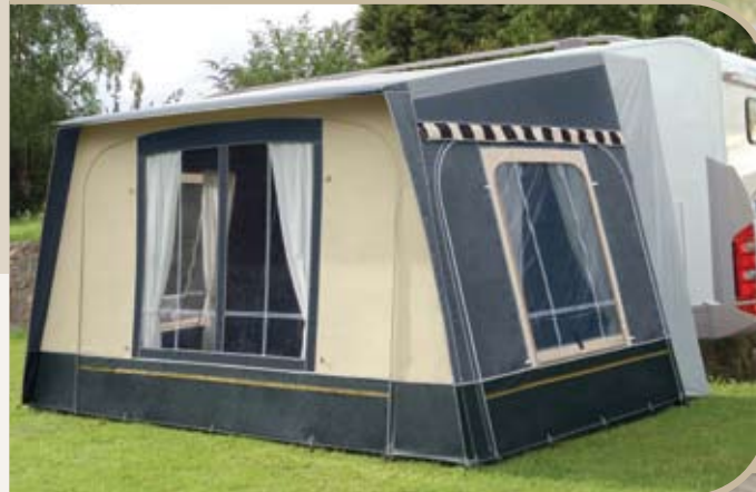
Inset above: Shown in Graphite/Sand.