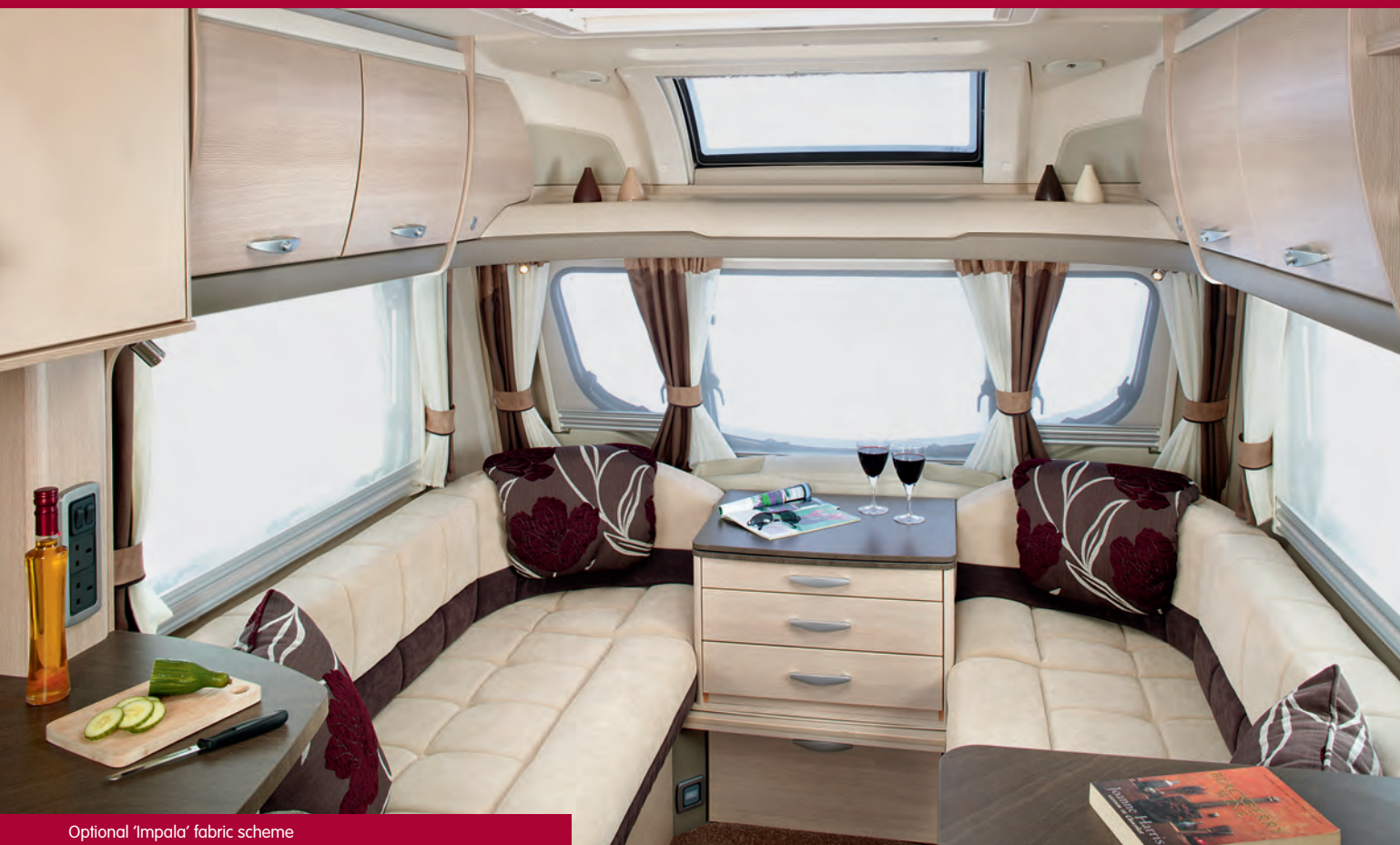
Optional 'Impala' fabric scheme