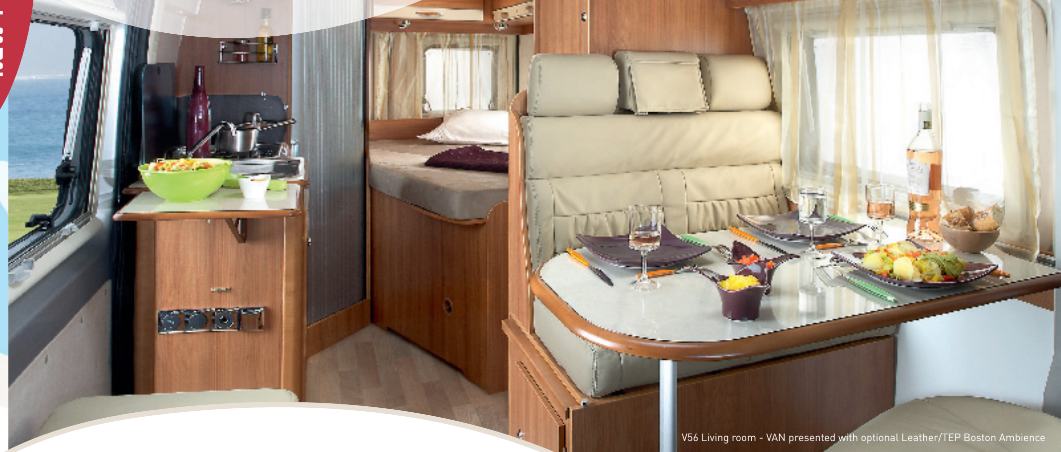
V56 Living room - VAN presented with optional Leather/TEP Boston Ambience

With 50 years experience in the development of motorhomes, RAPIDO puts all its expertise in this new VAN. Its polyester shell matches the smallest internal shapes (specific insulation) and allows to enlarge space. The result is both comfortable and functional: a perfectly calculated circulation space and an optimal arrangement of four living areas. You'll enjoy a large living room for five guests, a kitchen, 4 beds (including 2 for children) and a real bathroom. Harmony Furniture brings a breath of freshness to your home. Add your personal touch by choosing one of three optional fabrics. Once you set foot on the electric instep, you immediately feel at home.