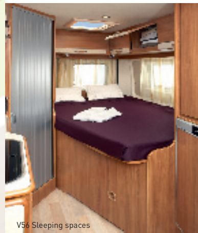
V56 Sleeping spaces