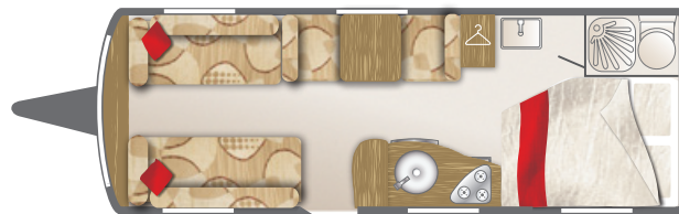
530-6 6 Berth