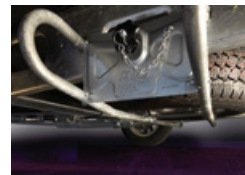
AL-KO Chassis mounted spare wheel carrier and spare wheel

The method of calculating the MRO and payload figures has been changed for the 2011 model year. Allowances for essential equipment previously accounted for in the user payload are now either within the MRO (e.g. gas cylinders) or the personal effects payload allowance (e.g. leisure battery).