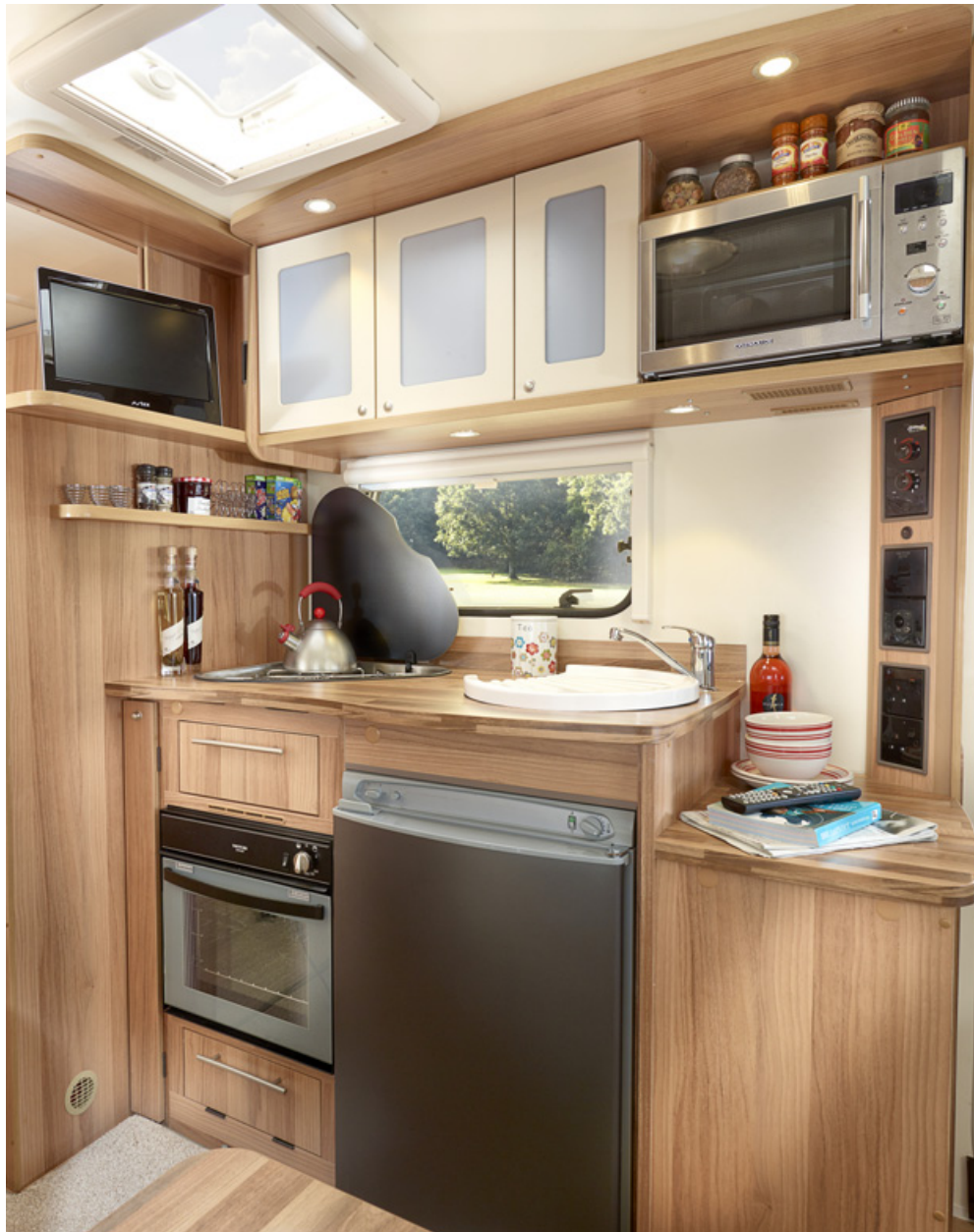
Orion 530-6 (Television not included as standard specification)

360 degree product tours for all layouts can be viewed on the Orion microsite: www.baileyorion.co.uk