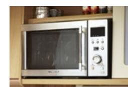
Stainless steel 800 watt microwave oven