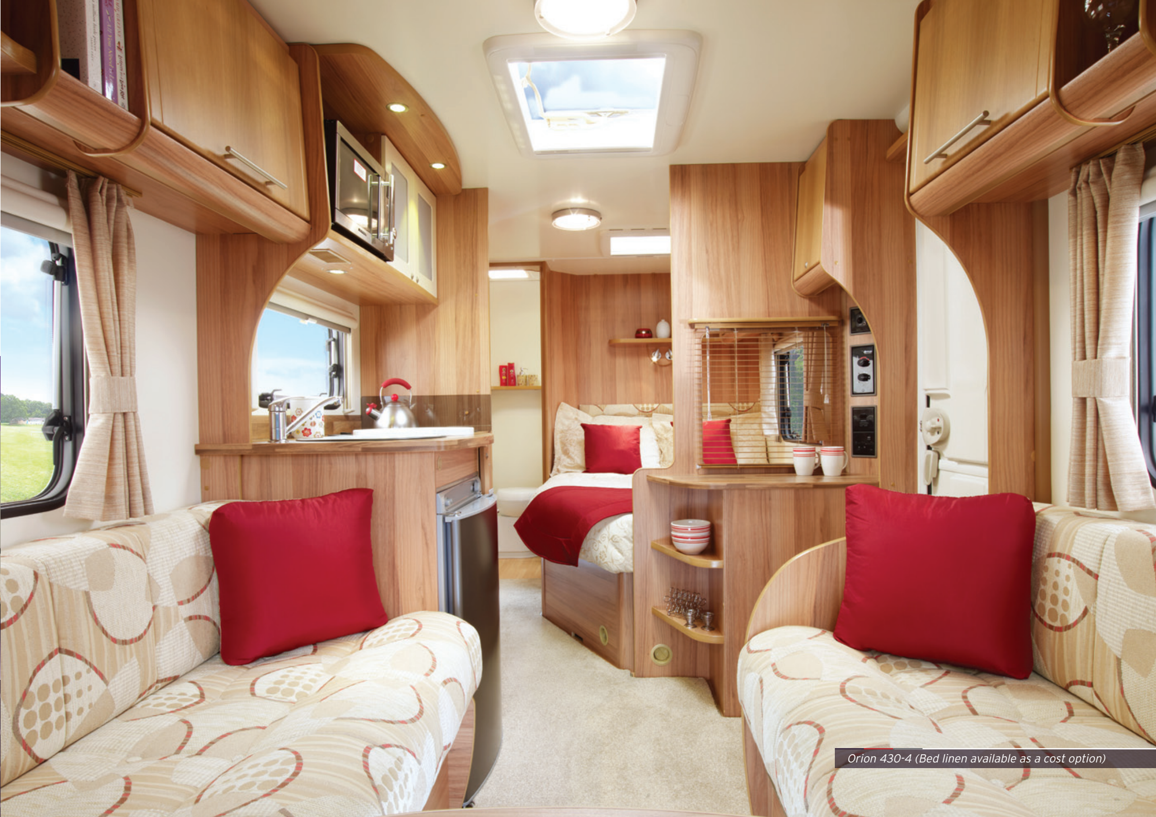
Orion 430-4 (Bed linen available as a cost option)