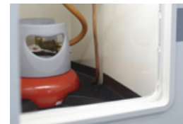
Centrally mounted gas bottle locker