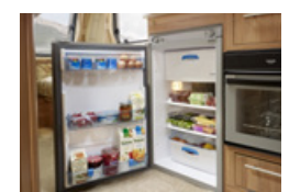
Thetford 107 litre refrigerator with full width freezer compartment