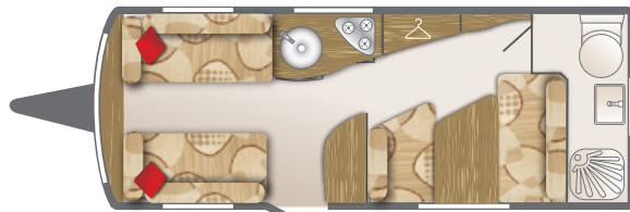
440-4 4 Berth