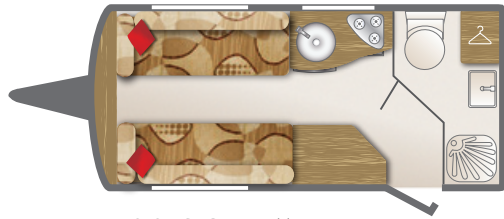
400-2 2 Berth