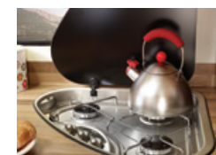
Thetford 3-burner gas hob