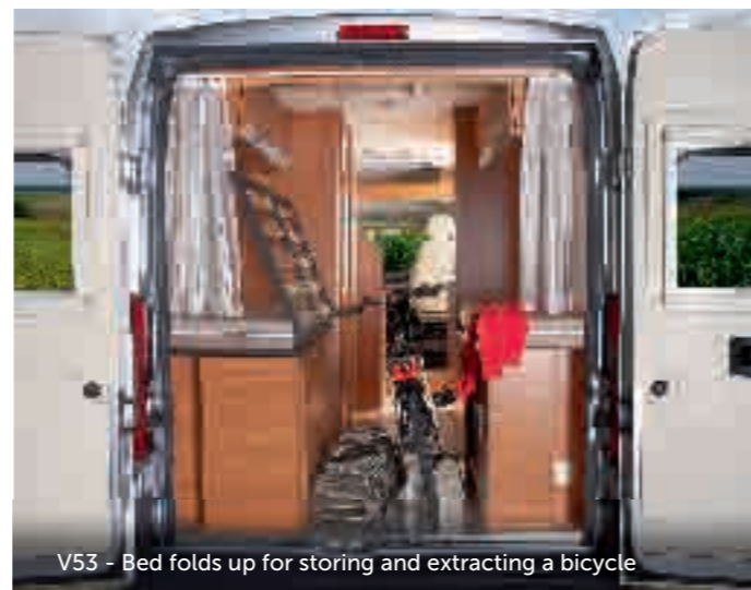
V53 - Bed folds up for storing and extracting a bicycle