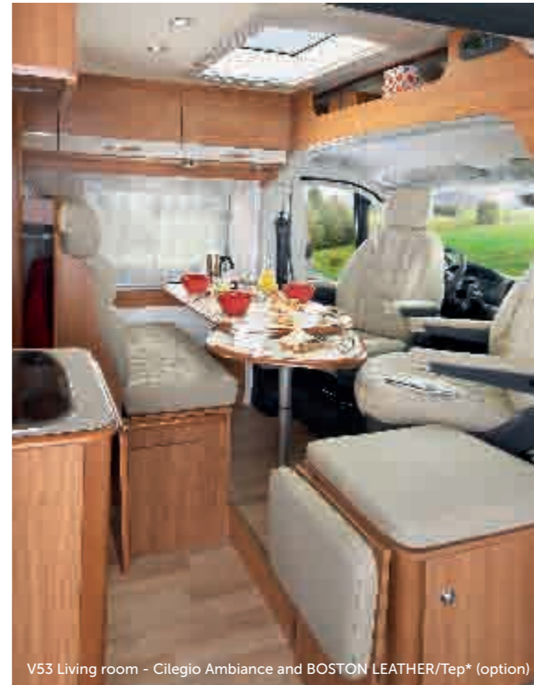
V53 Living room - Cilegio Ambiance and BOSTON LEATHER/Tep* (option)