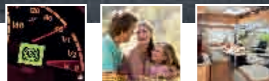
VAN V56 presented with optional front STYLE and metallic paint.