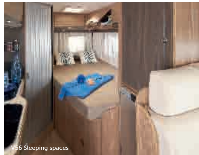
V56 Sleeping spaces