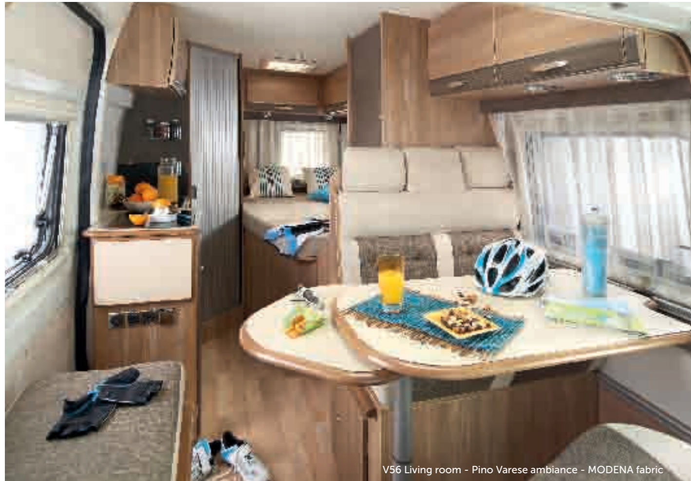
V56 Living room - Pino Varese ambiance - MODENA fabric