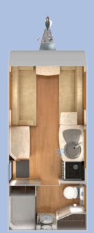
Quasar 462: 2 Berth