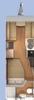
Quasar 544: 4 Berth