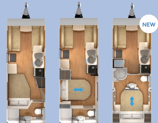
Clubman SE: 4 Berth