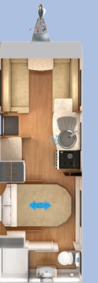
Quasar 574: 4 Berth