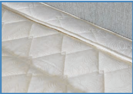
Optional mattress extension available for all transverse island beds