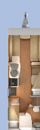
Quasar 586: 6 Berth