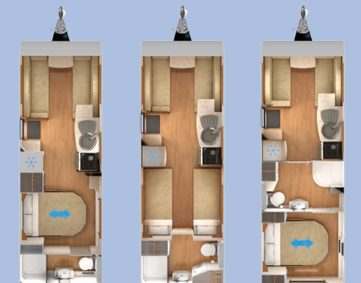
Delta TI: 4 Berth Twin Axle