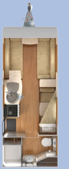
Quasar 524: 4 Berth