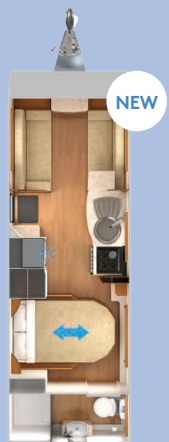
Quasar 674 4 Berth Twin Axle

1. Quasar 524 – with side dinette and shown in the optional 'AquaClean' soft furnishings scheme.