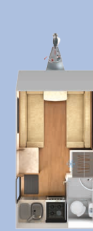
Ariva: 2 Berth