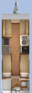
Quasar 554: 4 Berth